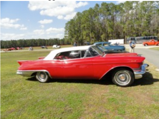
Quackenbushes' '57 Cadillac