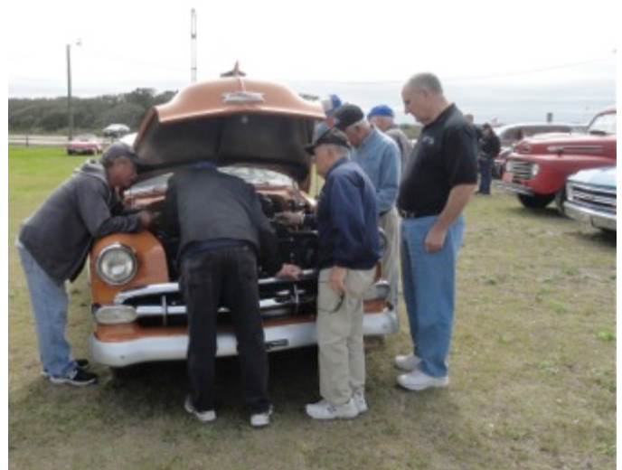
ACAC FROSTBITE PICNIC FEB 22, 2014