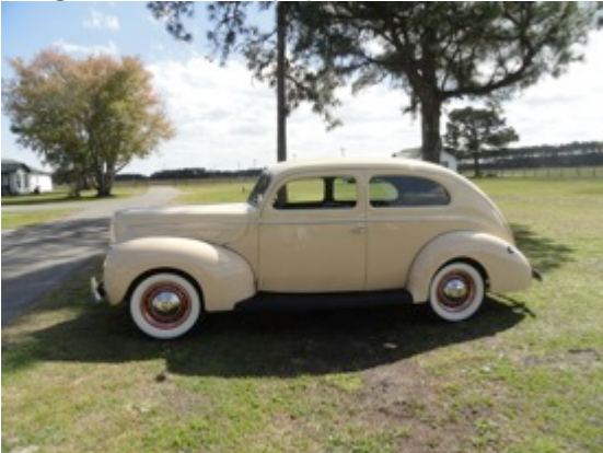
Hunsworths' '39 Ford.