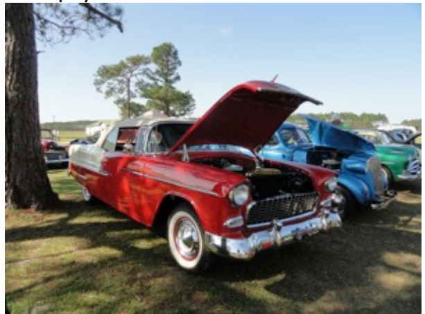
This 1955 Chevrolet convertible was just beautiful.