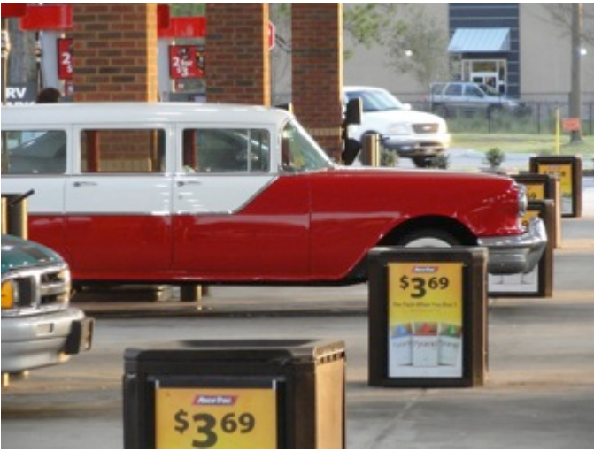
Carley King fills up for the trip to Rodeheaver Boys Ranch early in the morning. Other cars had already lined up. We understand that she had assembled herself at another gas station earlier.