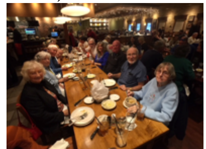
BUT—no blue tickets! A good time was had by all!