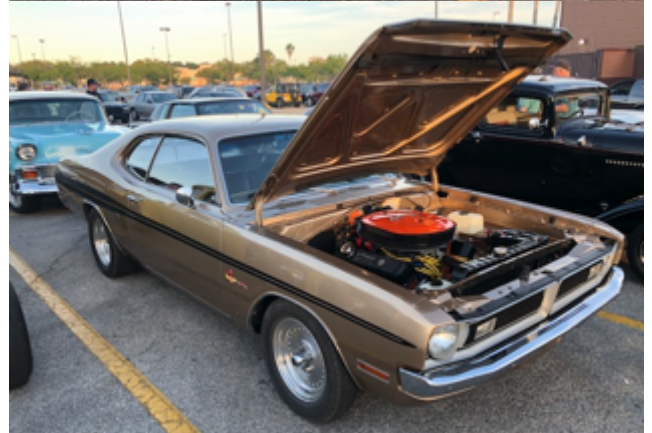
The gold at the end of the rainbow!