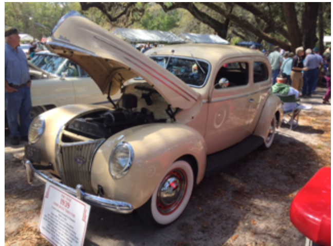
Always fun to see—Hunsworth's Ford