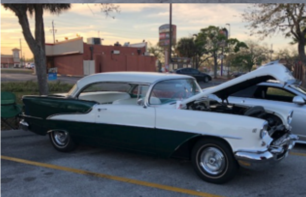
See article by Dewey Porter on page17