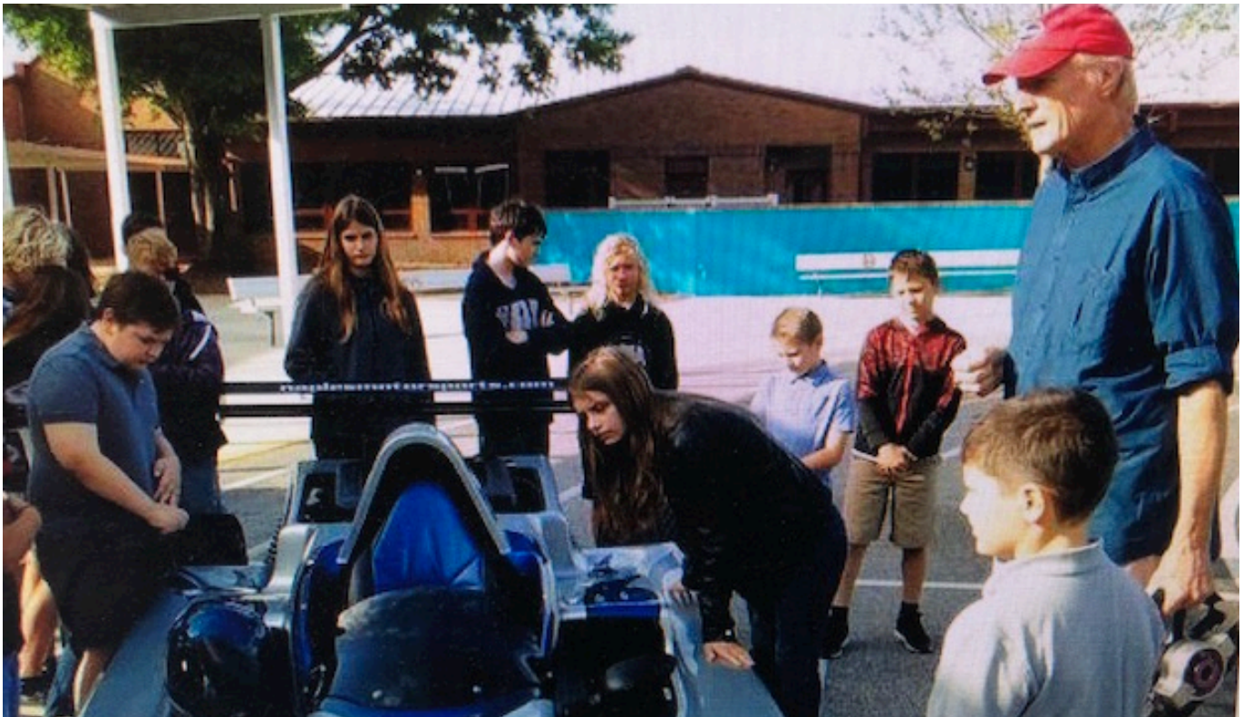
A Formula One race car rolled up at Old Kings Elementary School in Flagler Beach as part of a program to encourage independent reading by students.