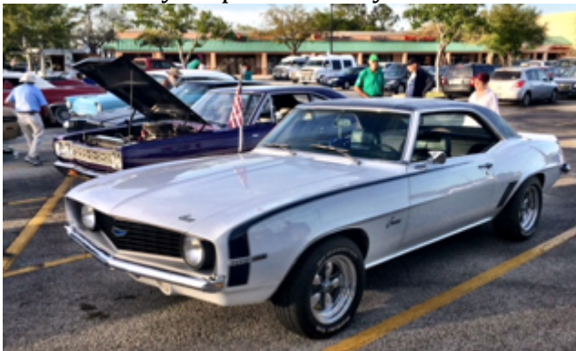
Did you notice? This photo belongs with the cars at the Cruise-In March 17, 2018