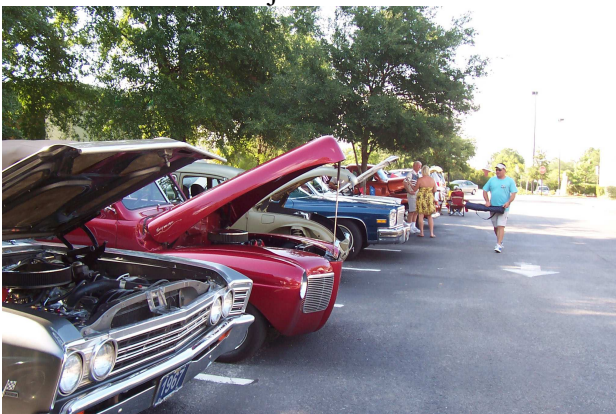
Primo parking places in the only shade