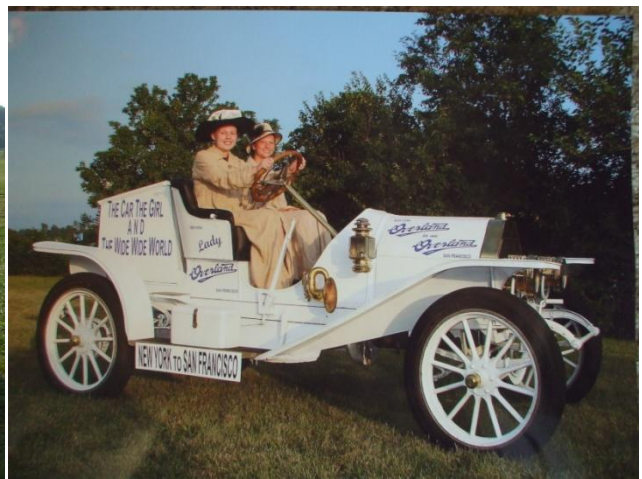
Our future drivers AND THAT'S ALL SHE WROTE!!!