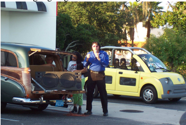
He looks and sounds just like Elvis