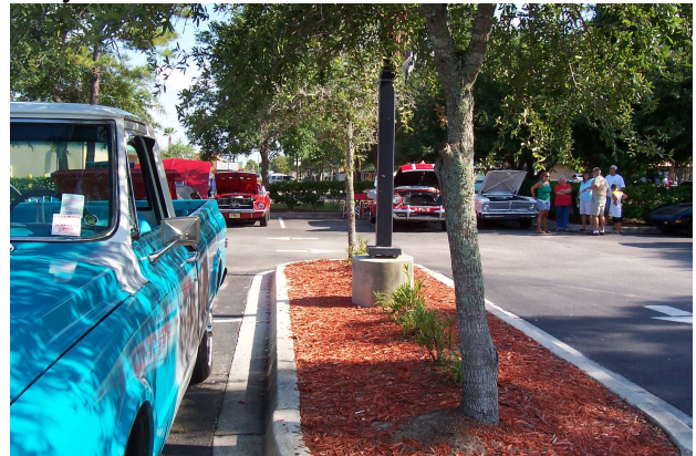
We hope next month will be even more well attended as word gets out to locals and nearby communities. Steak and Shake décor is right out of the Fifties and a great location for a cruise.