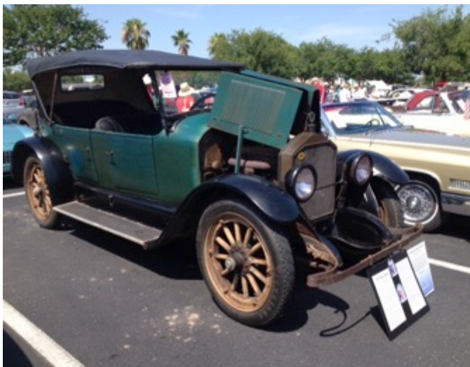
1920 Stearns-Knight L4 Touring Car-Jim & Tuni Weiss

The streets were lined with beautiful and interesting cars; it was like a car collector's dream of heaven.