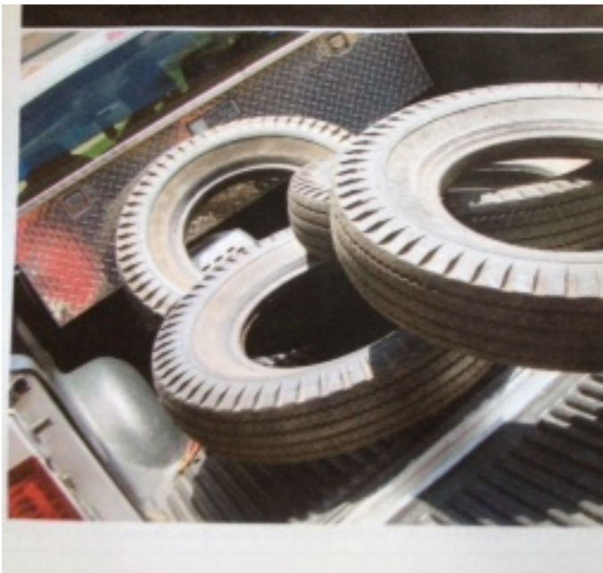
Additional photos of Portage Tires For Sale