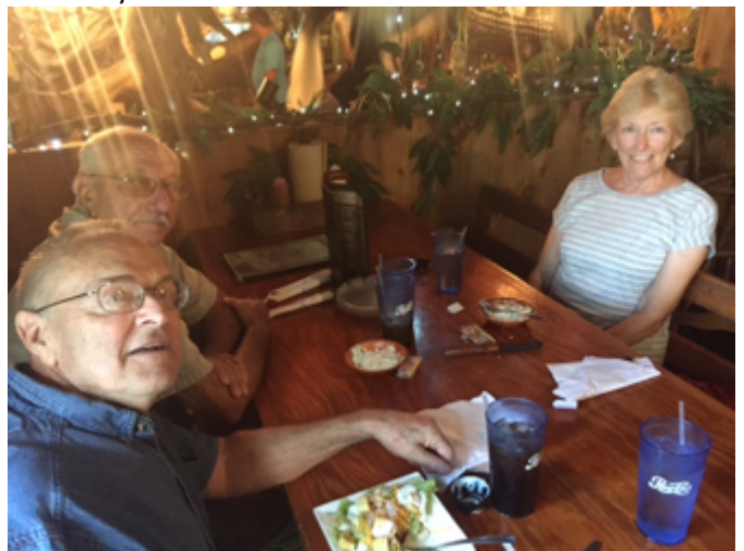
Other photos from Clarks were too dark.