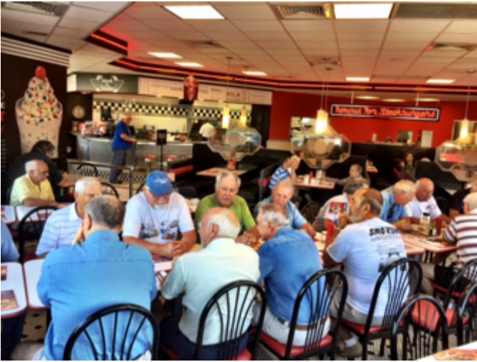
The other side!