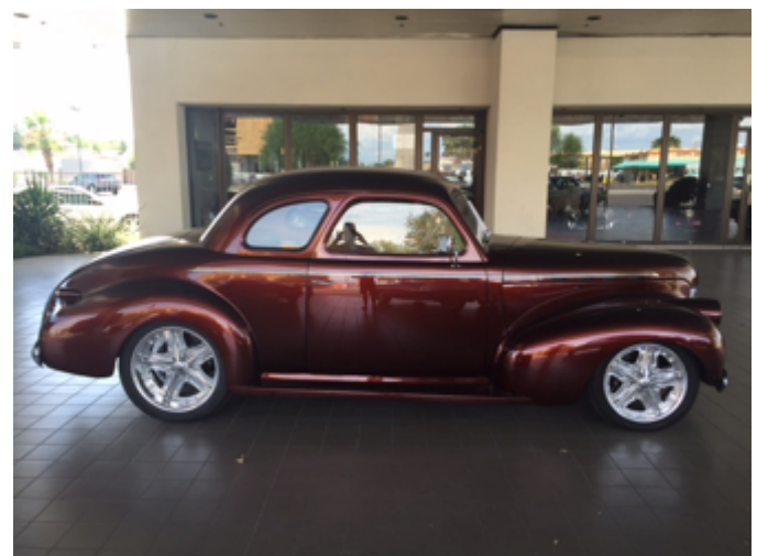
Barrett-Jackson Showroom, Scottsdale, AZ