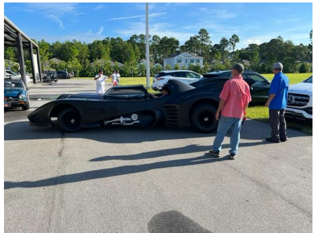
The batmobile was out today.