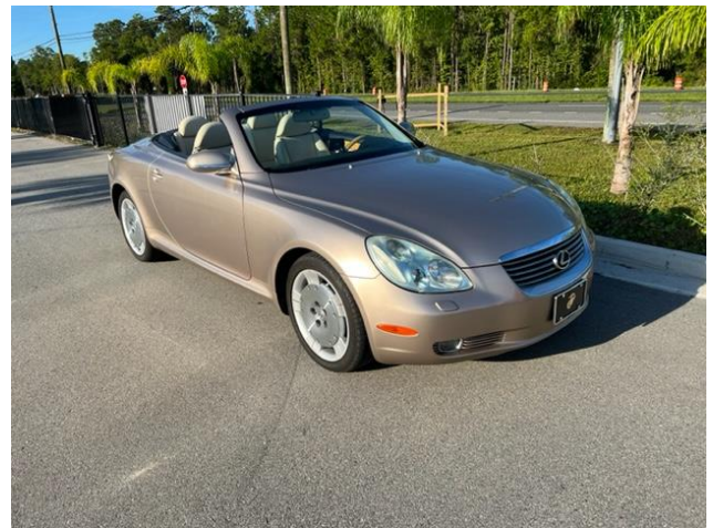
Joe Greeves - Lexus