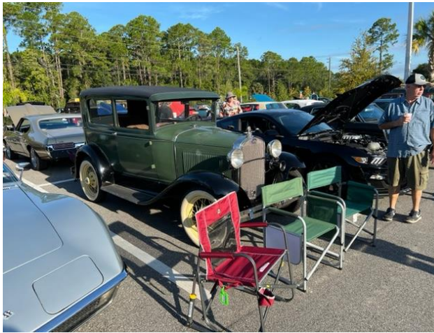
Jim Athos – Model A