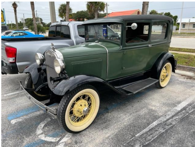
Jim Athos – Model A