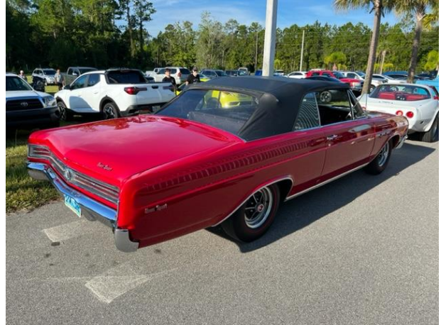
Glen Bakst – '68 Buick Skylark