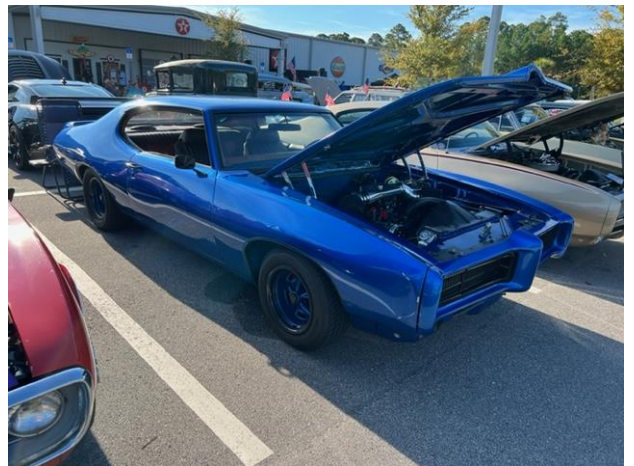
Skip Ferguson - Pontiac