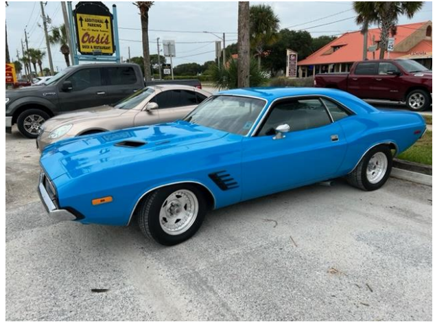
Skip Ferguson – Dodge