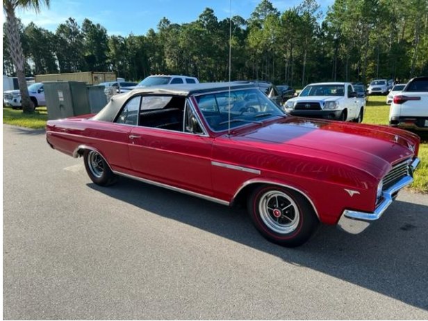
Glen Bakst – '68 Buick Skylark