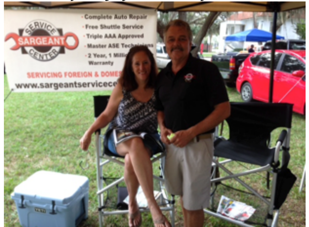
Sponsors enjoyed the day as much as those showing their cars.