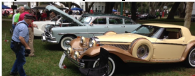
People couldn't get enough of these cars!