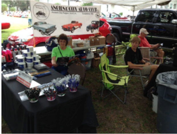
Door prizes and announcements were here!