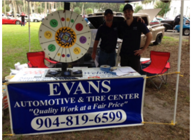
These sponsors got into the fun with a spin to win game.