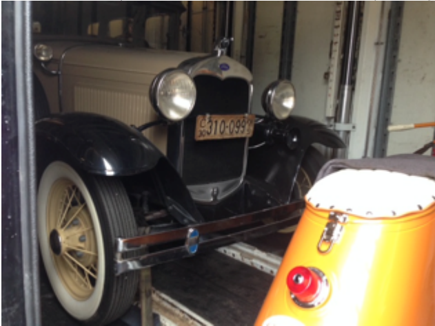
A first glimpse