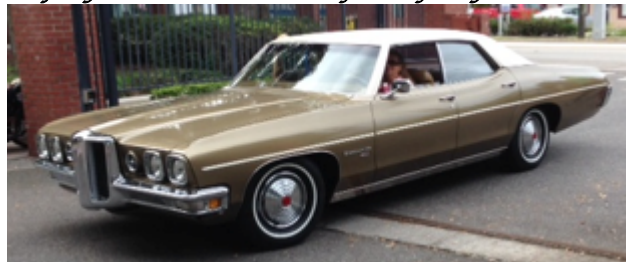
Old cars look newer every year.