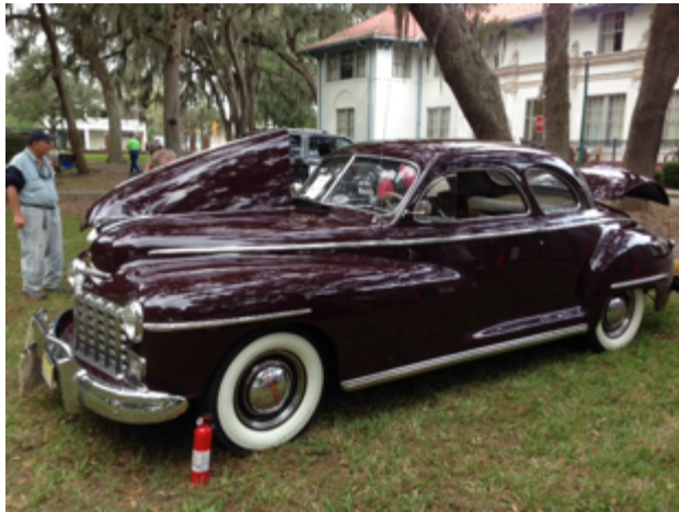
Perfect down to the fire extinguisher.