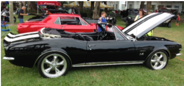
And Sassy Mustangs!