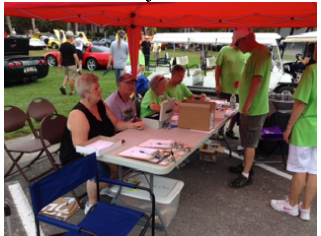
Registration table in full swing!