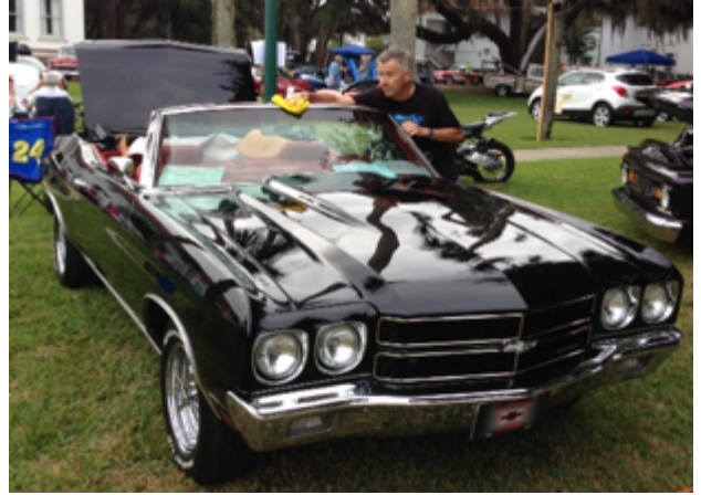
There was plenty of this kind of "shine".