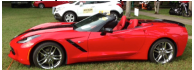
Beautiful Corvettes everywhere!