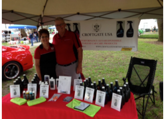
Specialists in detailing your cars.