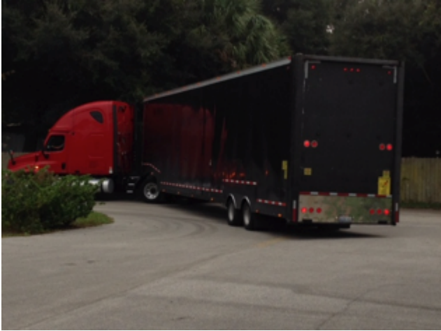
Covered transport eases into Sidney Hobbs' parking