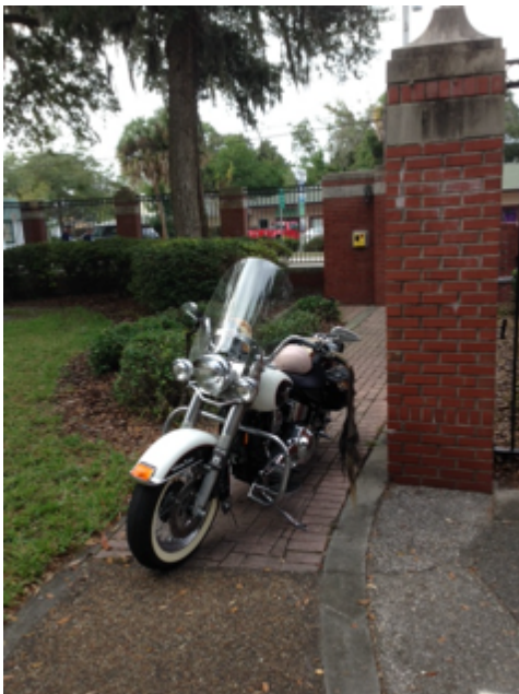
Beauty in hiding.