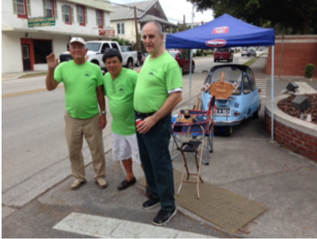
Who could resist this threesome?