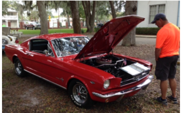
Dre - e - e - am, Dream, Dre - e - am...