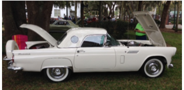
Tricked out T-Bird being judged.