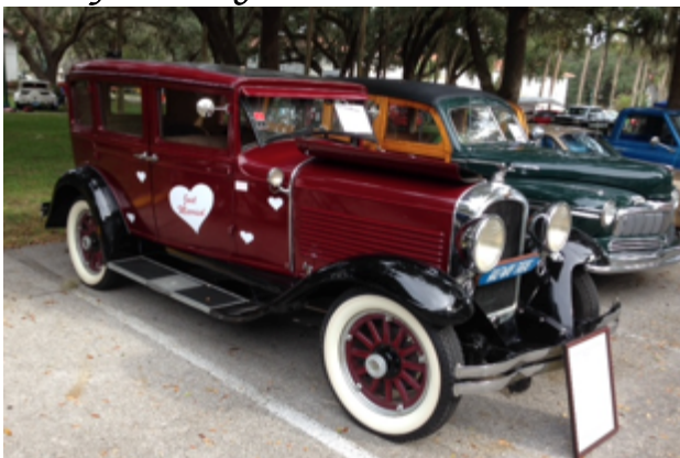
Chip Mitchell's '1928 Marmon Model 78 put in a rare showing. All decked out for a wedding!