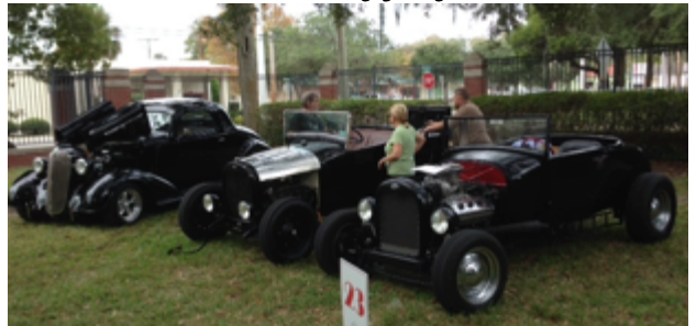
Hope you didn't miss the front forty!