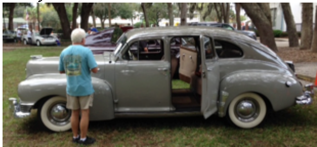
People show off the inside, the outside, the front side, the back side.