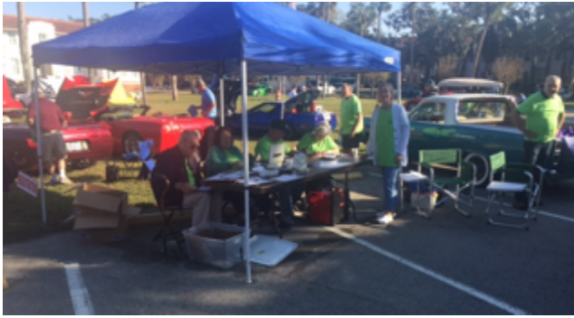
The registration table just kept on going with no let up until the gate was closed!