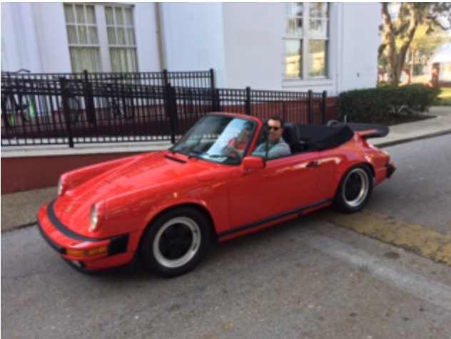
And a Porsche of course.