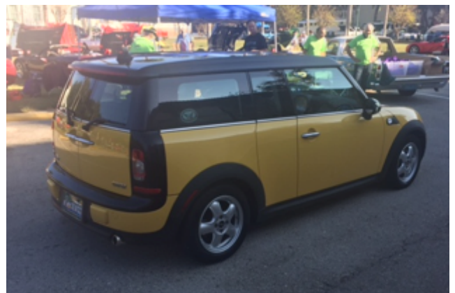
All sizes and shapes and colors. A rainbow on a perfectly sunny day!