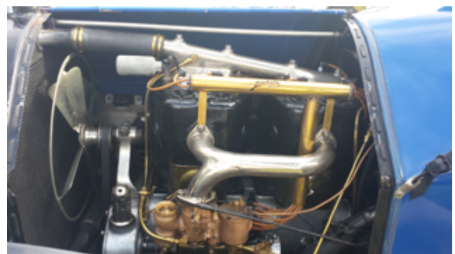
from Ormond Show)