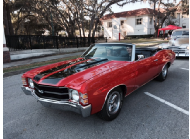
Happy Club Members welcoming cars.