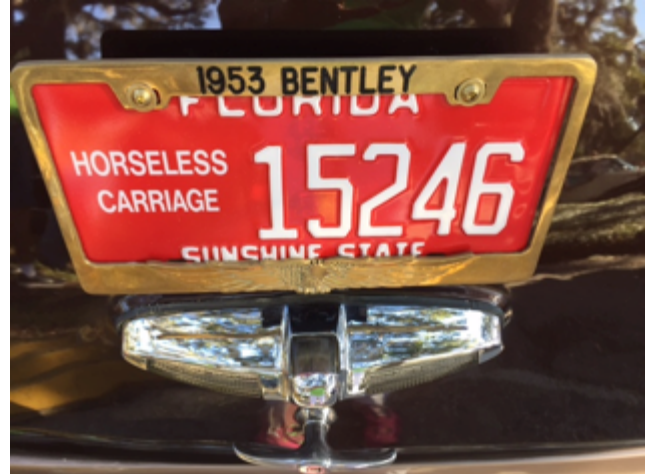
This car is berry beautiful.

Don't forget the Christmas Party Saturday, December 10 at Amici's Elections! food, fun, and music. 6 p.m.