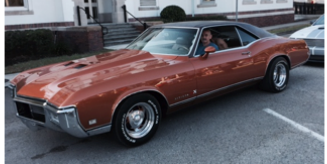
Notice all the beautiful reflection in the shiny sides of the cars.