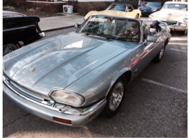
Father and Daughter Duo