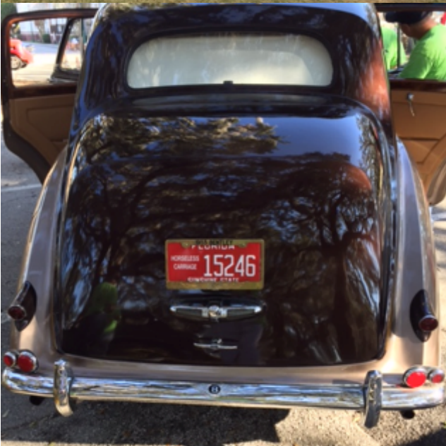
During the judging there was a lot to see.