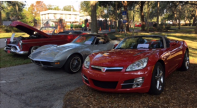
Some of ACAC's beauties on display.