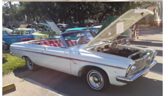
People were so comfortably enjoying the beautiful cars olde ande neue.