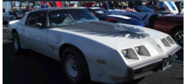
Three cheers for the red, white, and blue.