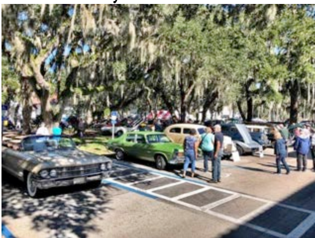
An absolutely glorious day! It started out cool and went on to perfect for all, the cars, the spectators and the participants.