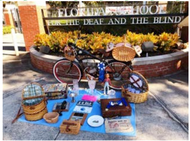
The entrance was decorated with Ron Leone's bicycle display, greeting people in style!