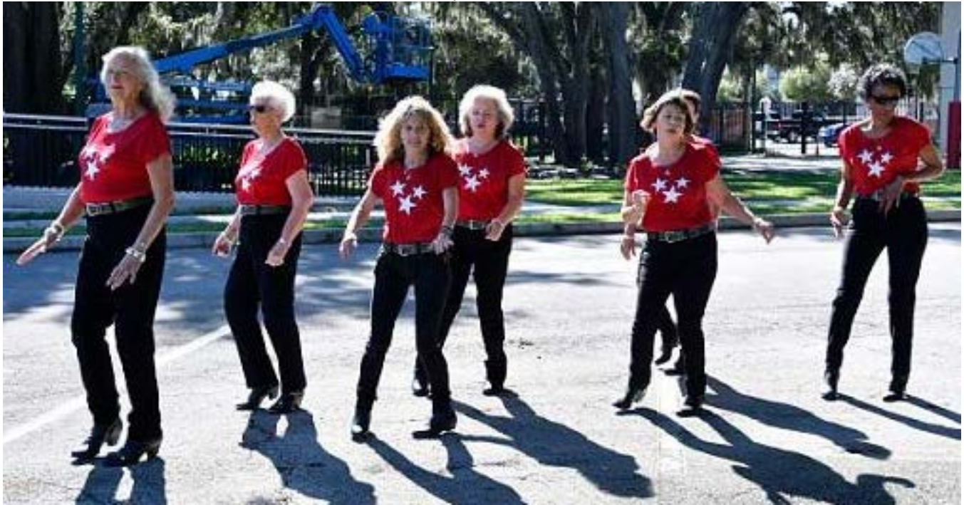
St. Augustine Line Dancers added some spark.