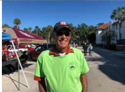
More Happy Campers.