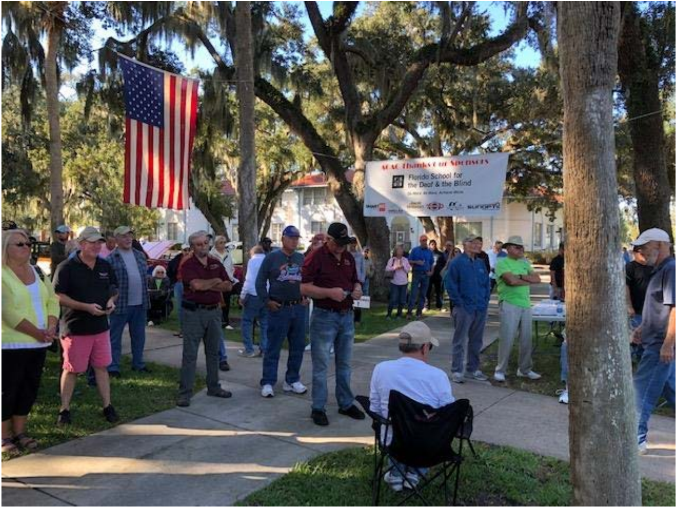
And Thanks be to God for our Country and the Stars and Stripes.