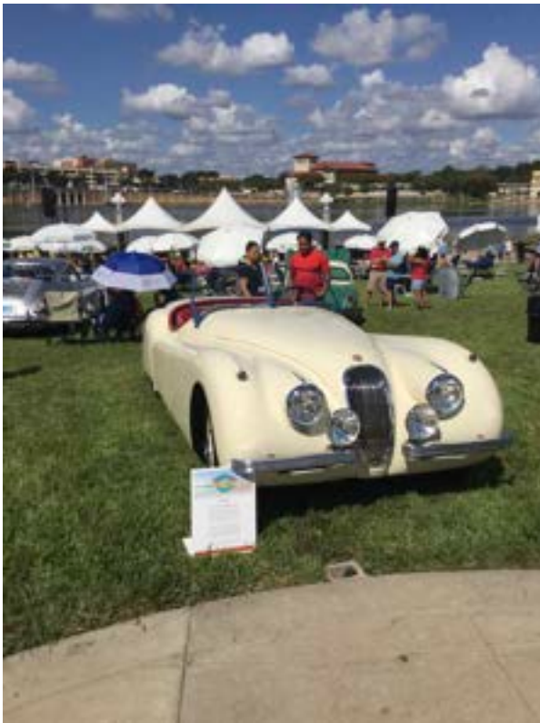
1953 JaguarXK 120