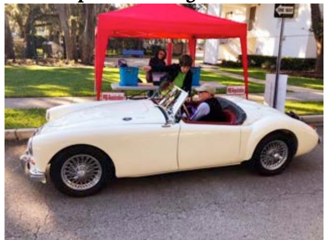
Registration was smooth and quick; no waiting around for filling out papers, etc.