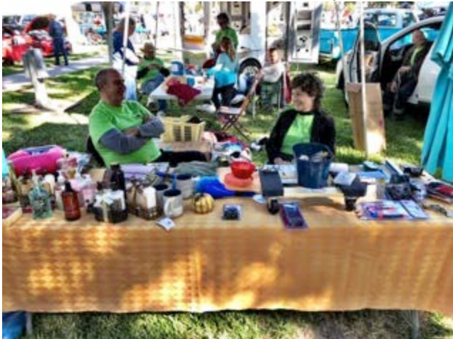
Plenty of Door Prizes