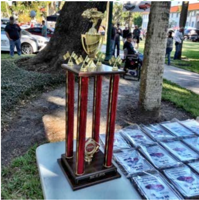
Trophies on display.