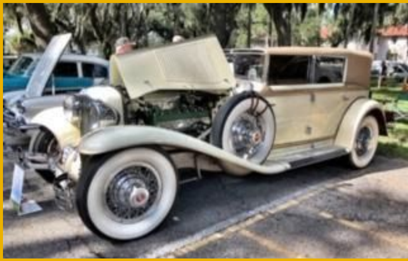
Sidney presents Best of Show Trophy to owner of 1930 Cord 4 door convertible.