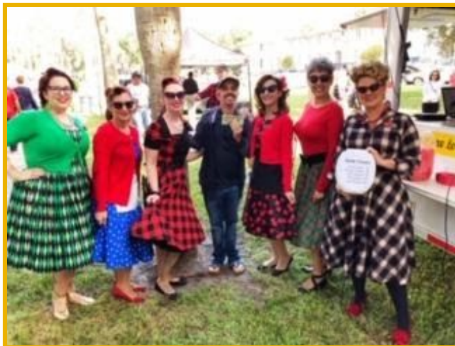
The Bombshell Belles present the happy 50/50 winner with $300