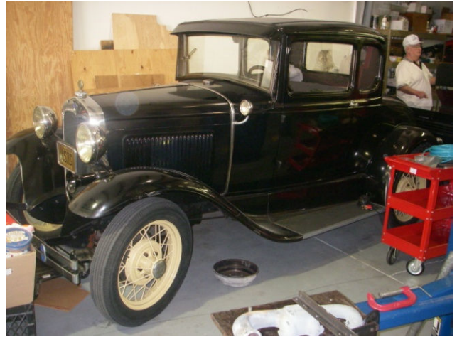
After that, we were privileged to visit a whole condominium of garages owned by various car enthusiasts, who graciously opened their doors and allowed us to wander freely. The ’30 Ford above has only 25,000 original miles on it!