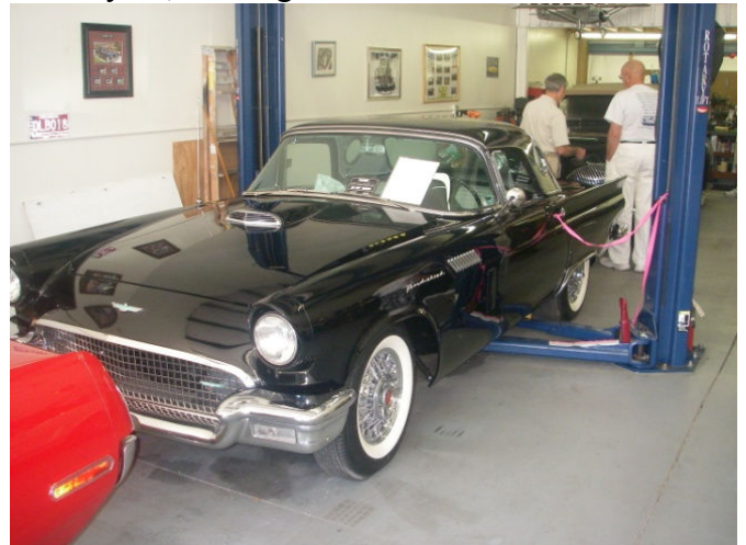
This rare “E” Bird was displayed in the garage of a Ford man. He had a ’66 Mustang and a 2011 Mustang also. There was another man who had 2 beautiful Hudson cars. Something for everyone!