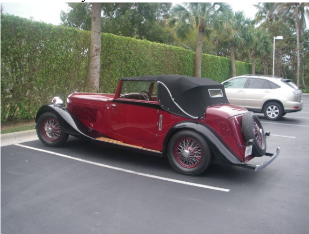
Tom Sutphen’s ’37 Rolls-Royce made a pretty picture in the parking lot.