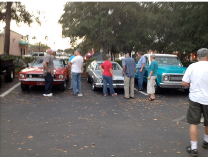
St. Augustine Cruisers faithfully gathered to socialize and kick tires.