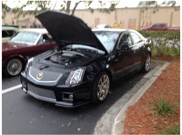
This car was fairly fresh. Car below owned by local vet—visited Cave later