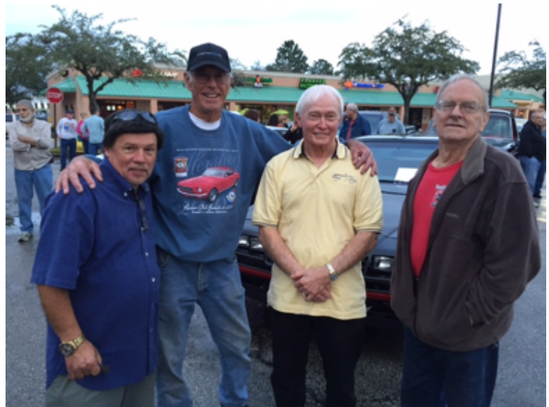
This photo was taken at the St. Augustine Cruisers' Cruise-In in January. What could be better than good friends and lots of cars?