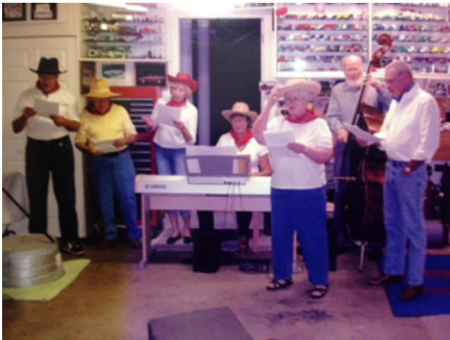
Remember when?