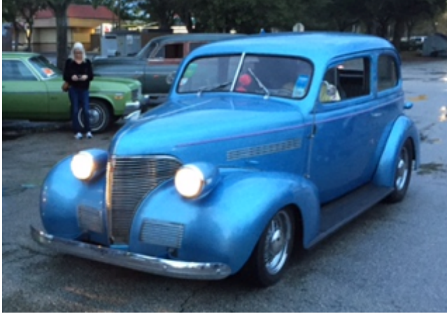
Rainy days and Mondays always make me blue.