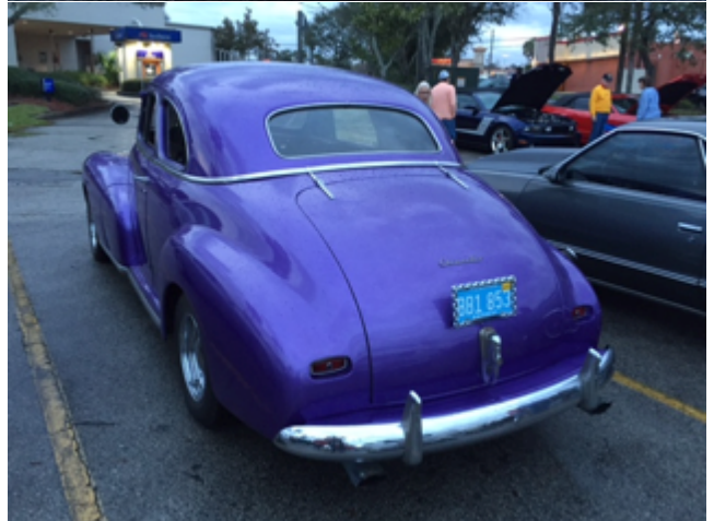
or purple. Check the activities list for the next Cruise-In-3 rd Saturday each month 5 p.m. - 7:30 or so.