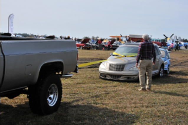
Where there's a will, there's a way.