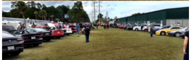
A field day for beautiful cars! The next one's purple.