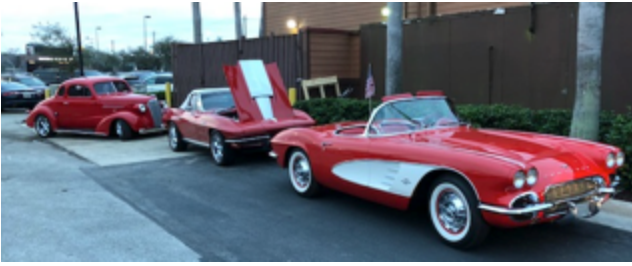
Red who dunnit line up.