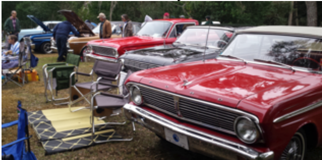
Recognize the front license plate?

About a week before the show I prepared our 1965 Falcon for the drive from here in St. Augustine to the show in Silver Springs. Including checking all the fluids, vacuuming the inside cleaning the outside and fueling up with Non Ethanol gasoline. It is about a 90 mile run and we prefer to take the local roads rather than Interstate 95, it's about 15 miles longer but a nice leisurely drive.