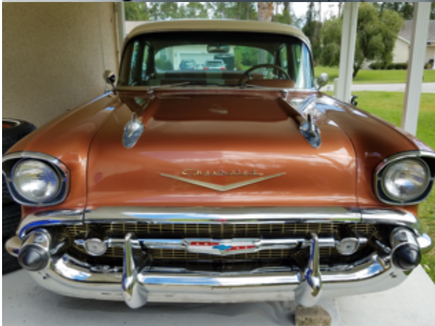
Every ending is a new beginning.