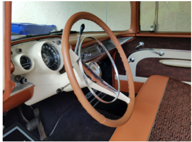
New interior and shiny chrome wheels.

Chevy to J&M Restorations in Bunnell. They had polished the 57 valve covers recently. After some discussion they told me that they had a triple plated bumper in their inventory. The car gods were looking out for me!! Talk about being lucky!!! I bought the bumper and my son and I attached it. There are some rust spots at the bottom of both doors and the car needs to be repainted sometime. I will detail the motor department myself. We are considering installing power-steering so Mary can drive it more easily. AC will be next. As with a car this old, dollars add up. I can do some work myself and I will farm out stuff that I cannot do myself. As always, with any of my cars, the 57 Chevy will always be polished, detailed and ready to drive. Please see attached pics of before and after. Thanks to Jinny for using the story and thanks to Doug for bird-dogging for me!