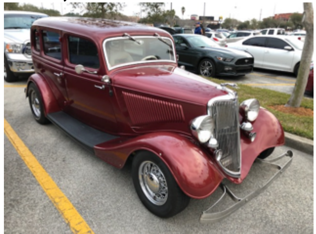
Nothing wrong with that!