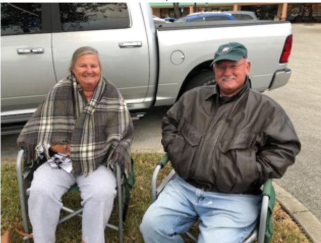
Hunsworths bundle up against the cold.