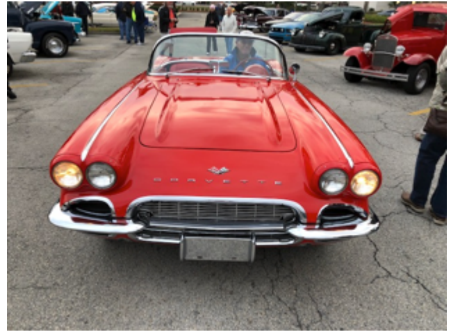
Bill Soman with Little Red Corvette