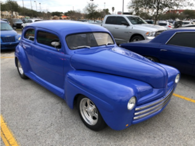
Blue, Blue, my love is blue.