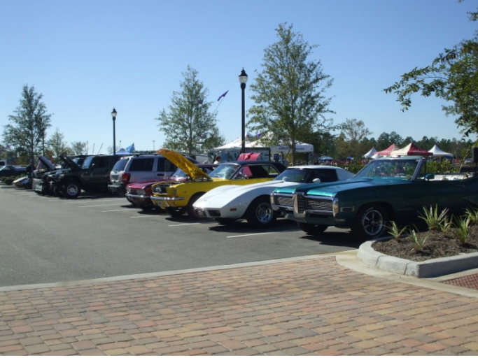
The cars weren't bad either. The local Corvette Club had a really nice display of old to new, there were several street rods and classics and some big trucks.