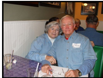
Forty-two ACAC members enjoyed the Installation Dinner of 2012 board members at the Gallery Cafe