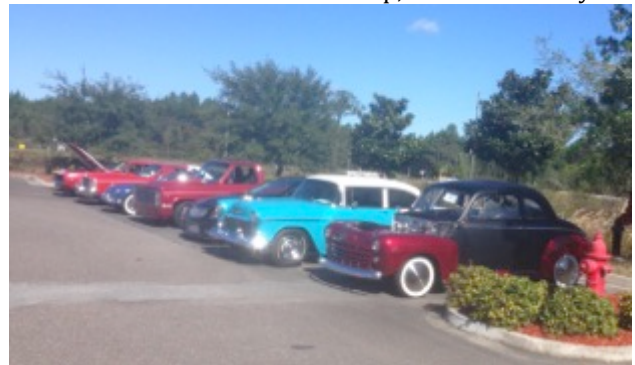
Good line up of Cruisers.

We've not had so cold a day since this car show up at Good News Church near the World Golf Village on November 1 to benefit St. Jude.'s. Stalwarts gathered nevertheless for frozen fellowship, fun and frivolity.