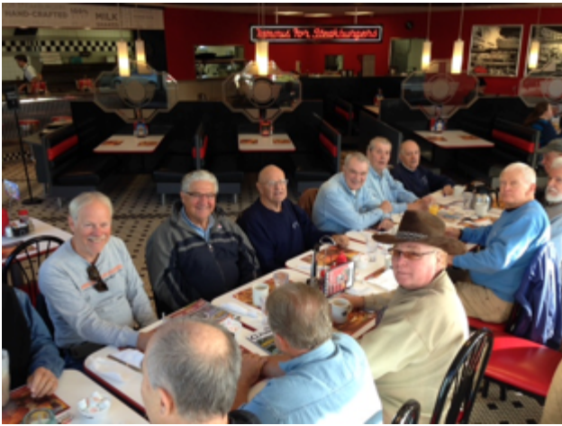
December 12 th gathering of Old Guys with Old Cars at John's Breakfast.