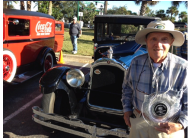
Pretty nice trophy; excellent car! Nice day enjoyed by ACAC members.