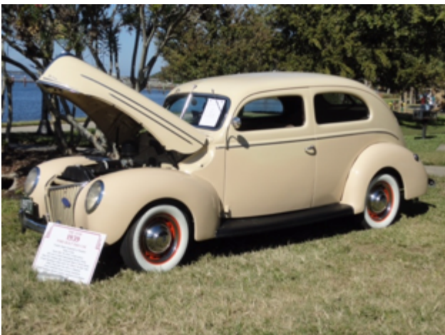
Y'all recognize this fine Hunsworth-mobile.