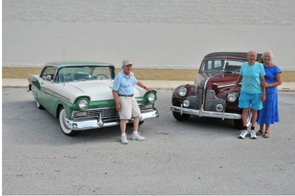
Our Founding Members