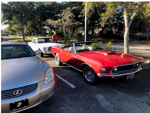
Notice the only convertible of 6 with the top up!