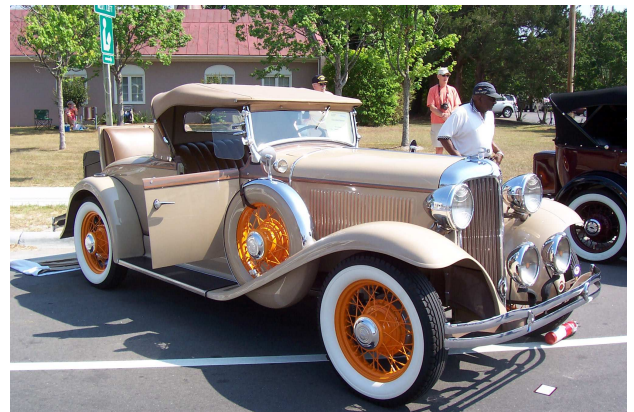
31 Chrysler roadster my favorite car of the show