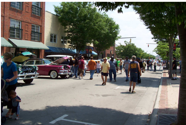
All entries were parked in downtown streets

96 degrees, a record for that date in New Bern N.C.