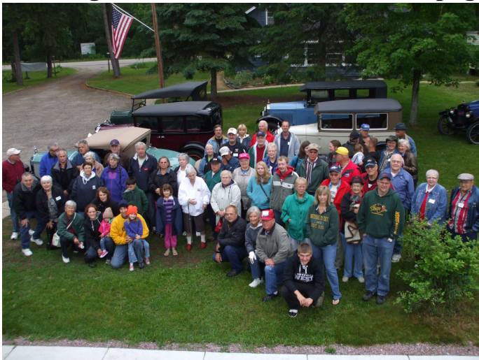
Members of the Upper Mississippi Chapter