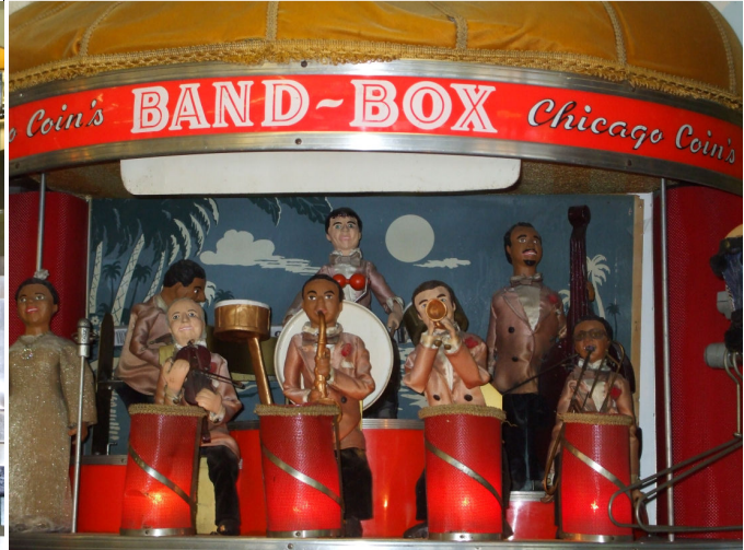
If you ever get to Madison Wisconsin, you should make a side trip to Ella's Deli, for sure!!!