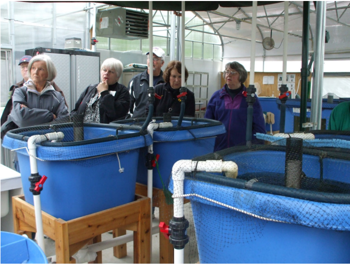
The tilapia tanks