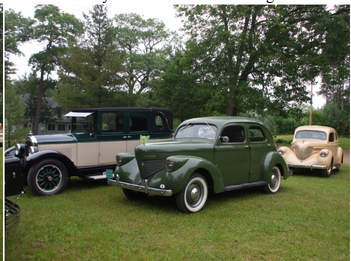
Willys, Overland's and Knights from the teens to the late 30's