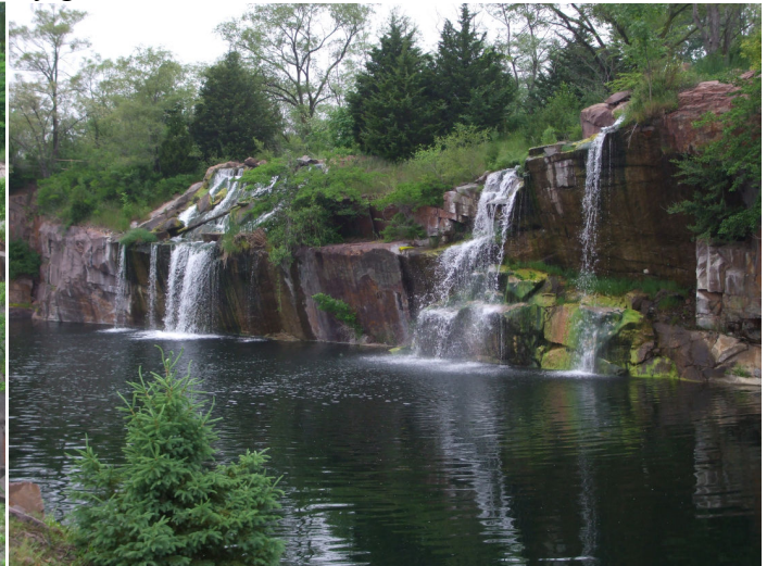
The last time we saw rocks like these were in Disney...and they were all fake!!!

Back into our cars, on country roads, through dairy farms galore, next stop...Stewart’s for lunch, and yes, of course we had to have Root Beer! Here are 2 of the youngsters that attended, enjoying some ice cream after their lunch.