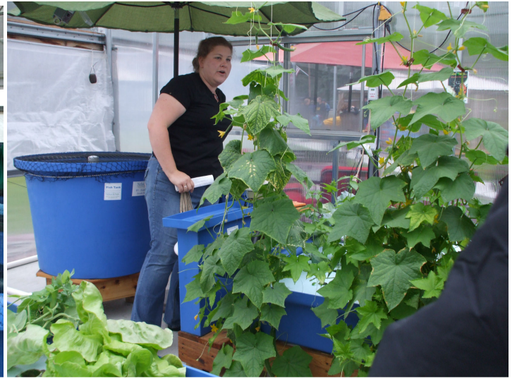
a couple of the cash crops lettuce and cucumbers

After leaving the Aqua-culture farm we were back in line for the next drive of the day. Next stop... a beautiful waterfall with real rocks. Friends in our group were puzzled by my interest in rocks...then we explained that when we moved to Florida, we had to “buy” rocks for my gardens!!