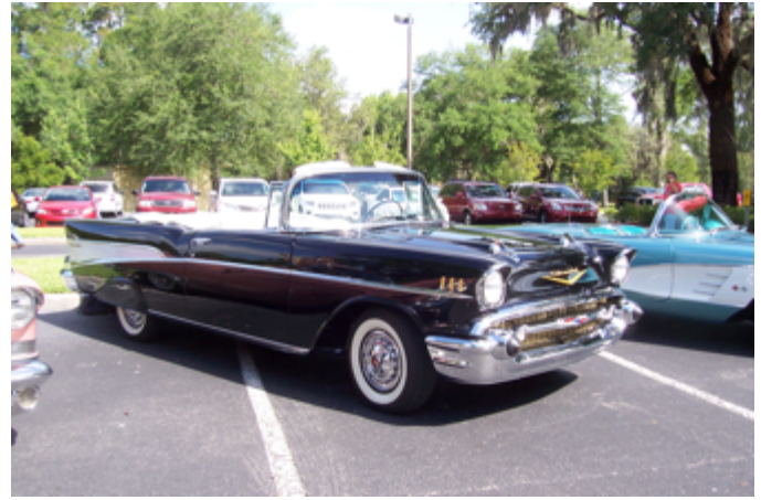
Sidney Hobbs 57 Chev Belair convertible (a lucky neighbor drove this one)