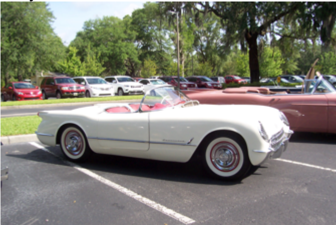
Bill Soman- 54 Chevrolet Corvette