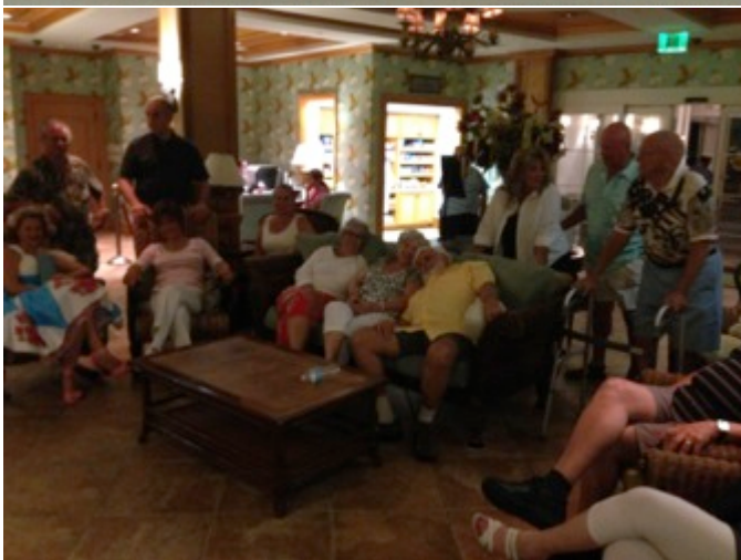
Next month—ACAC at the Villages