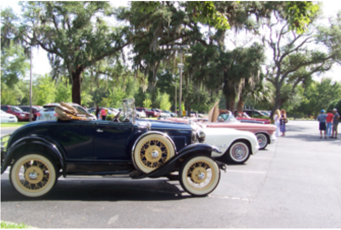
Toby Erwin 31 Ford Deluxe Roadster