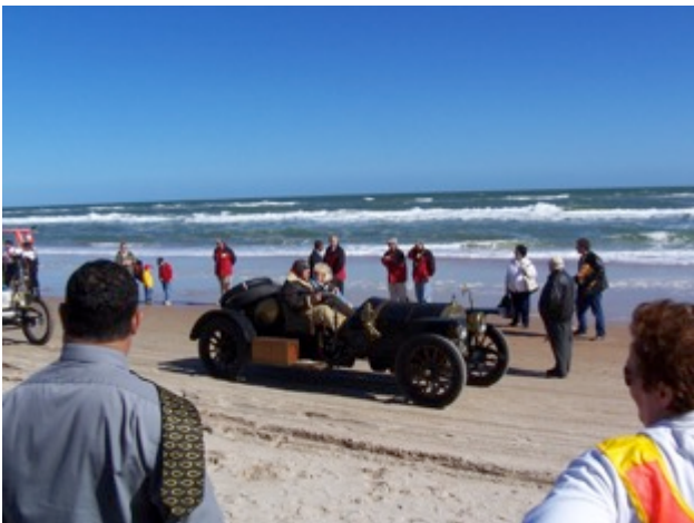
Remember this fun time?