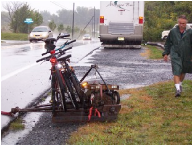
This is also "fun" from the past. You'll recognize the guy at the right and probably the month will be obvious, but what was the year?