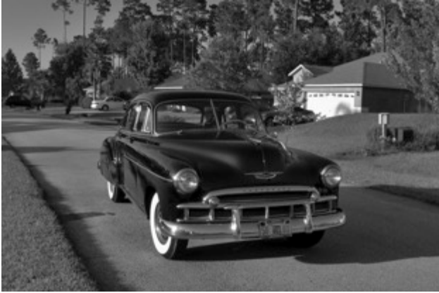
Do you know who used to own this car, and can you guess the year of this photo?