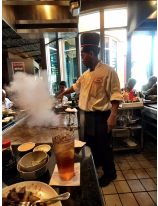
Next month, it's Ice Cream at Cold Cow!