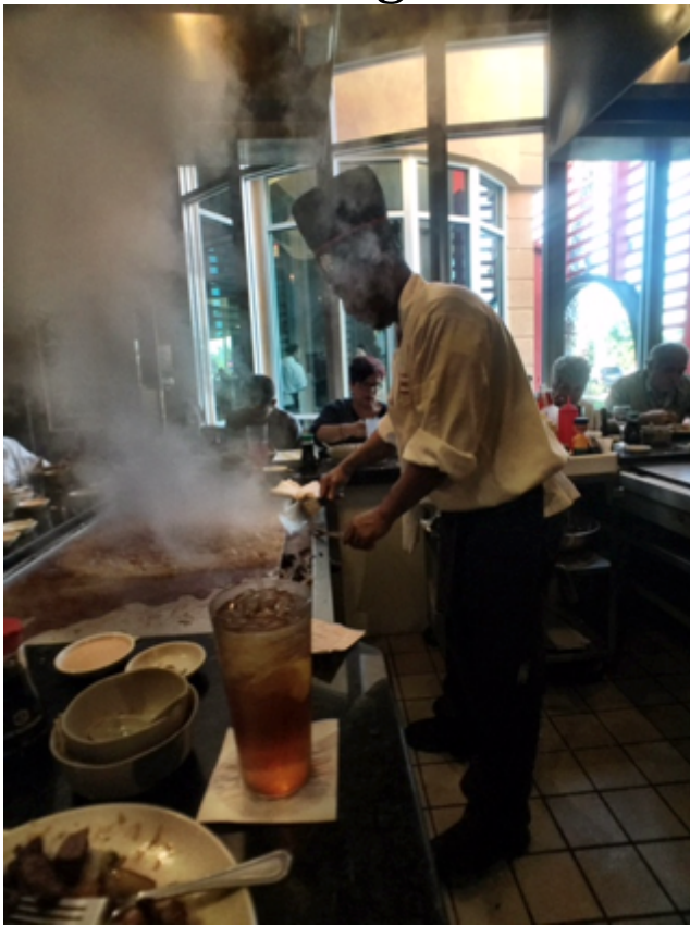
Looks like there were about 20 members gathered around the table at Yamato's for a sizzling Japanese meal and lots of fun and friendship!