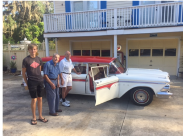
These guys are ready for breakfast!

IF YOU HAVEN'T CALLED DONNA, CALL NOW 904-940-1005