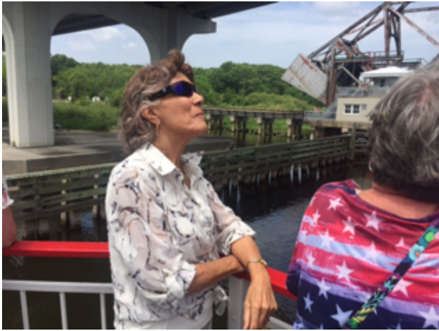
We had to wait a while for this bridge across the St. Johns to allow us through.