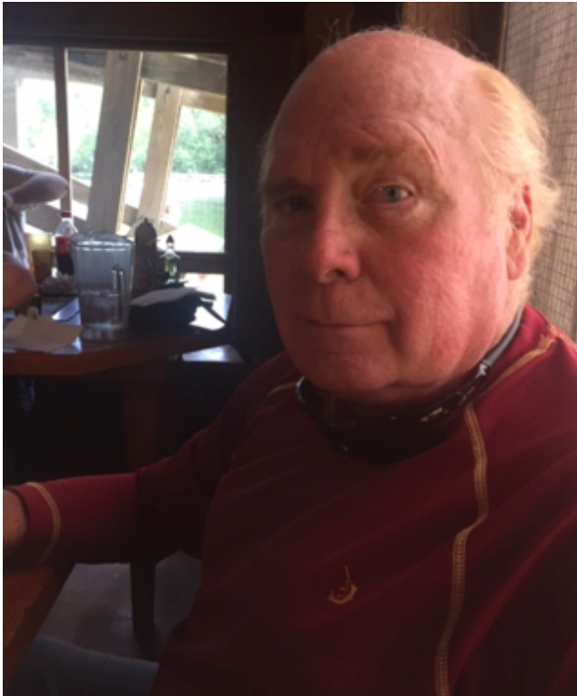
Mysterious man sitting next to me. Says he's going to post this on Facebook.