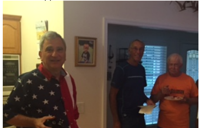
Extremely amazing! Thanks! Jim & Rita