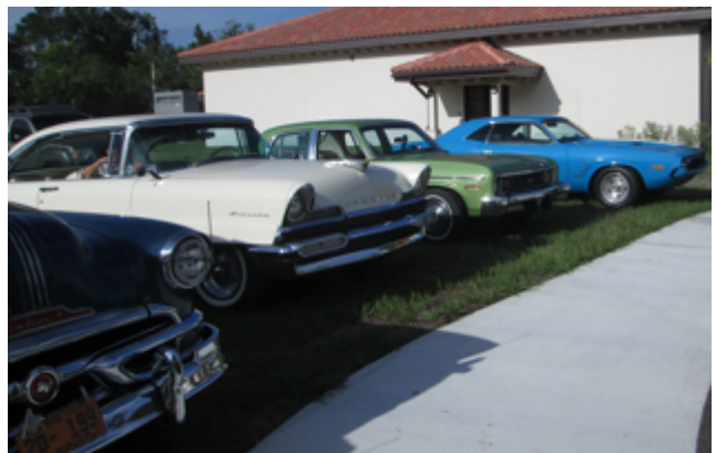
Nietzel, Arpaia, Emery, Ferguson line up