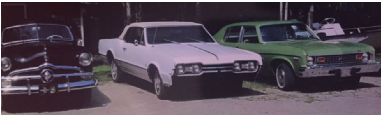
The Emerys were asked to give a brief history of their car collecting –See page 2!