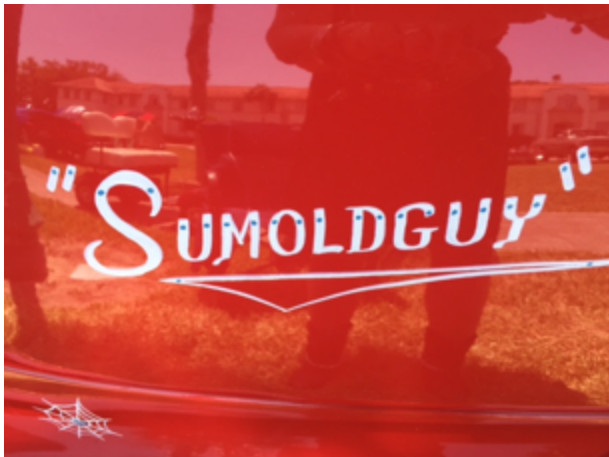
was there, too.