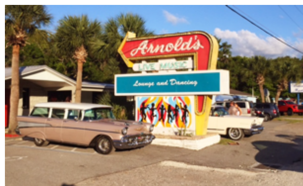
Here you can see Max and Jan’s ’57 Wagon with Arpaia’s Lincoln’s nose peaking out from behind the sign.