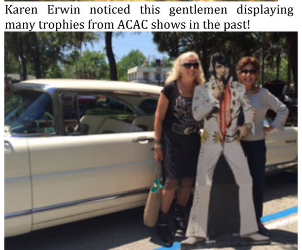
What's a car show without Elvis?