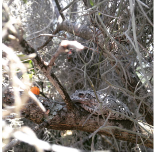
I toad you dere was someone in da kumquat tree.