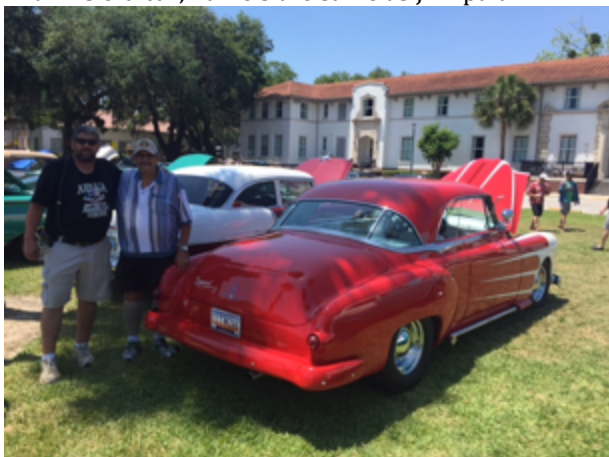
Father and Son with 1952 Chiefton—all in the family!