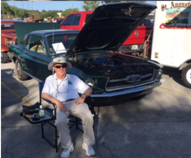
Dewey's Mustang is For Sale!