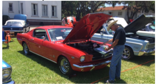
Is that your car?