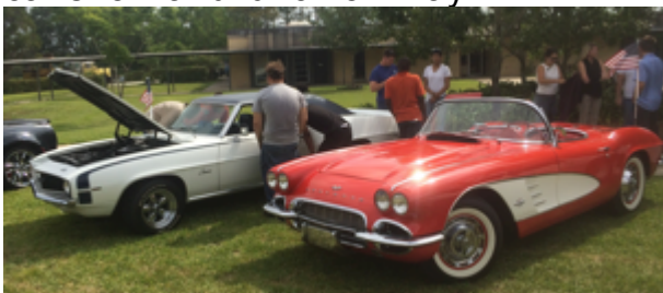
ANCIENT CITY AUTO CLUB TOURS ST. JOHNS TECHNICAL CENTER MAY 17, 2016

We had 15 cars and 25 members at the first coast technical college for the car show and lunch on May 17.