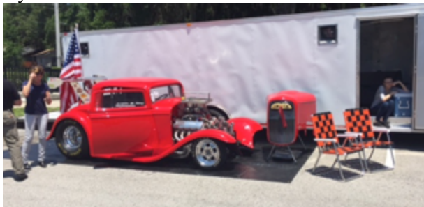
In the end the Cruisers put on a really good show and we all went home happy and tired. -Jinny