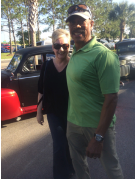
Another good photo!