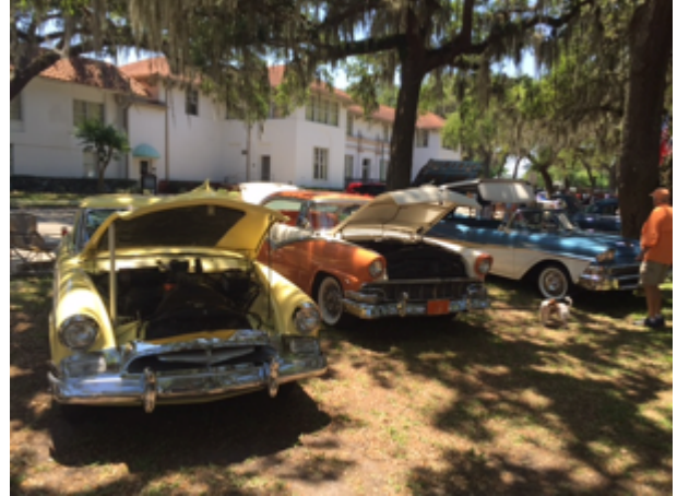
Must be feeding time.