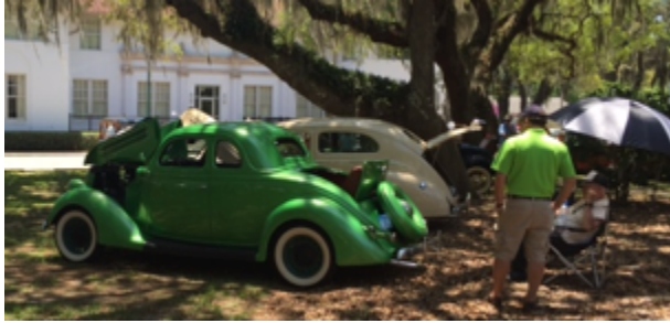
You could always paint the car green.