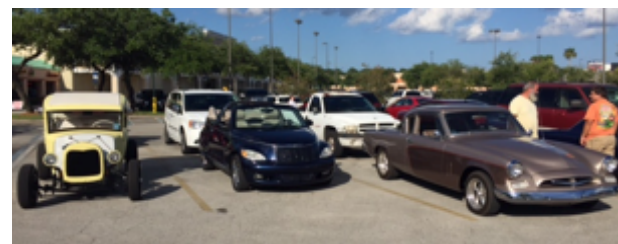
Perfect way to end a day.