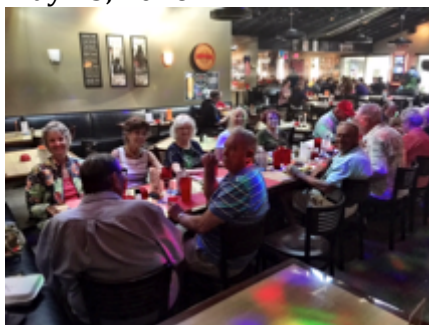
Although the place was dark, we were able to identify