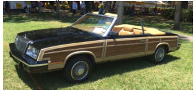
Woodies always shine.