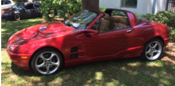
Interesting. Kay Wells pointed this car out. Qvale?