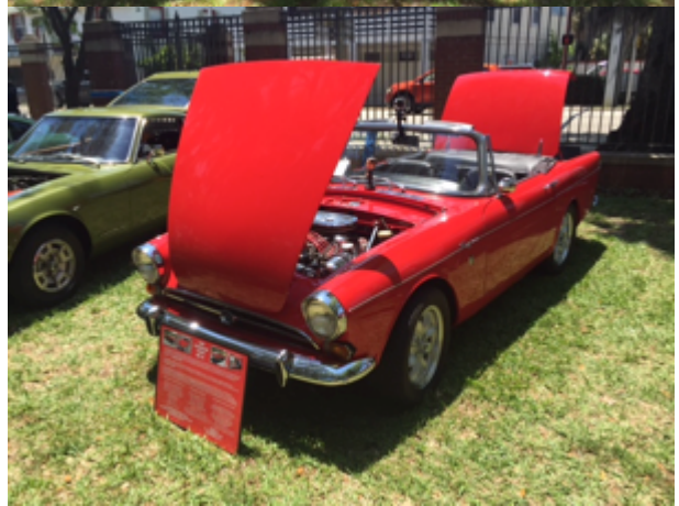
No shortage of red cars.