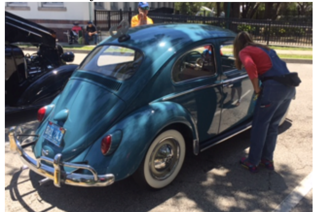
Who can resist a bug?