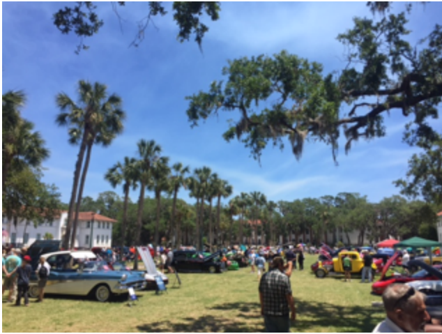
Field of Colors