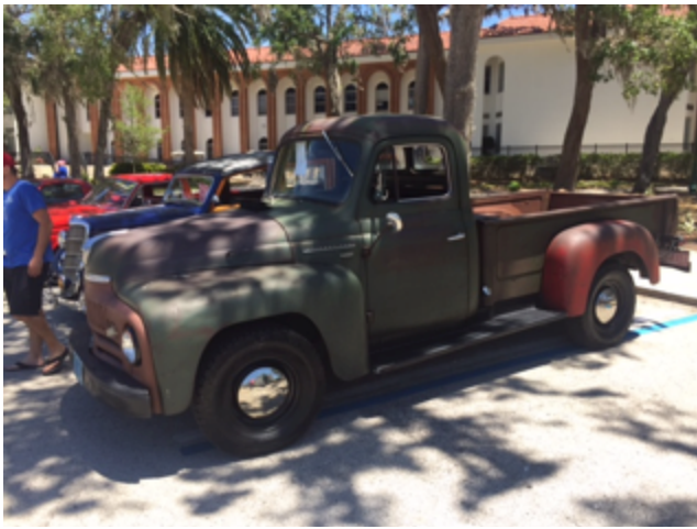
Well camouflaged; I can hardly find it.