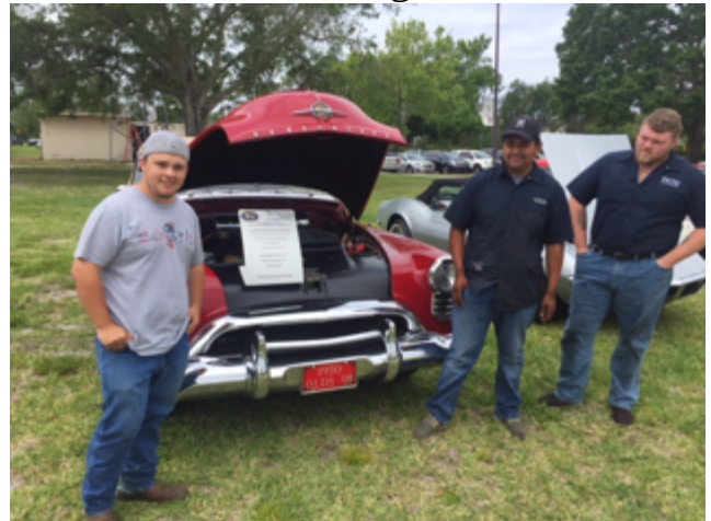
Some of the guys.