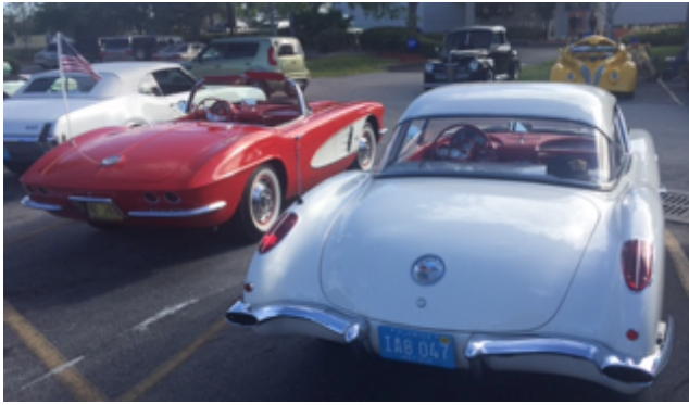
Dynamic Duos above and below!