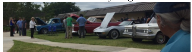
Beautiful gray-ish day for taking photos.