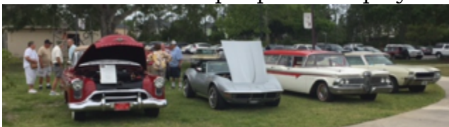
We made a pretty line-up.