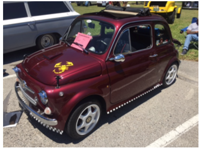
It's just so darn cute!