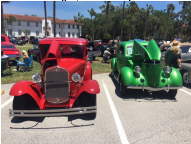
Not so with this duo. or these.