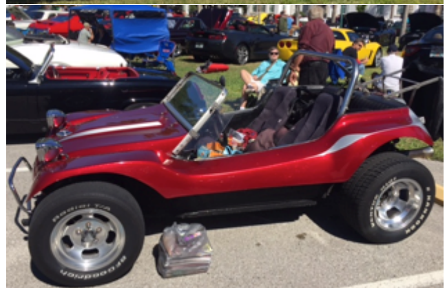
What did mankind do for fun before they invented the wheel? These are the “more” photos from the St. Augustine Cruisers’ Car Show held at the Florida School for the Deaf and Blind, May 6, 2017