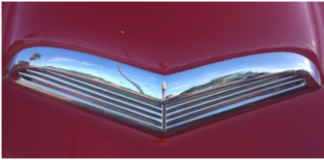
And this one is pretty.