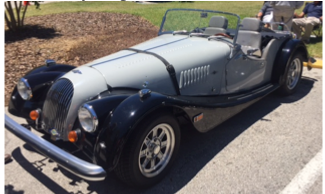
Maybe this one!