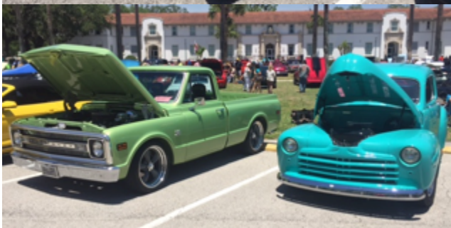
So energizing and enthusiastic!