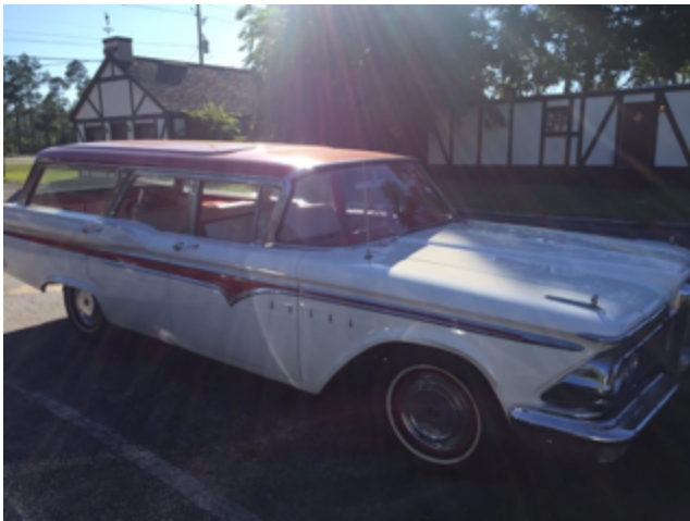
As you may know from past experience, getting to the restaurant on time with this group only ensures you that you won't miss all the courses. 6 o'clock means 5:30 and so on—