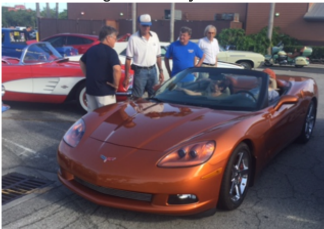
The crowd gathers.