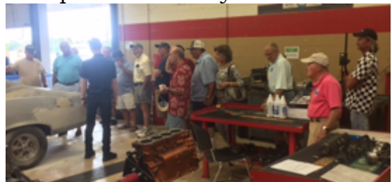
ACAC CAR DISPLAY AT SA TECH SCHOOL May 2, 2017