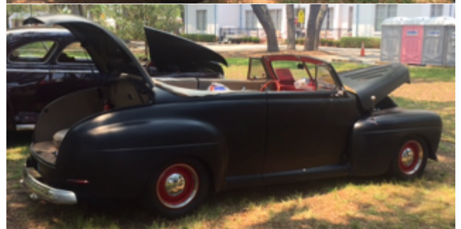
More photos on page 14