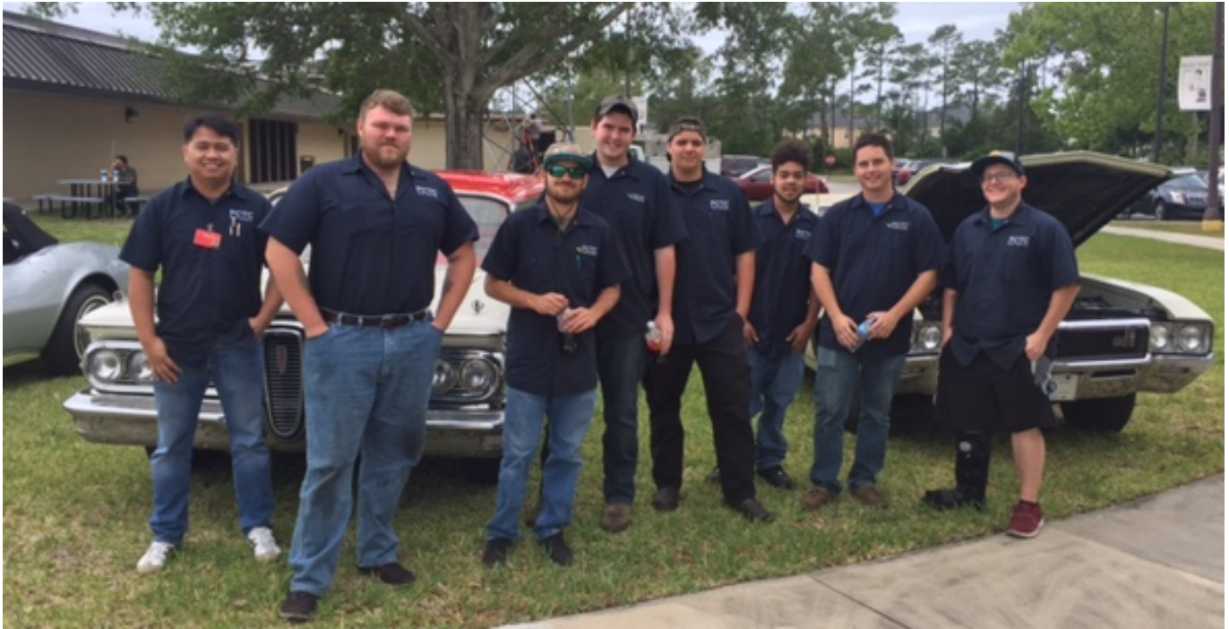
Students at FCTC gather to admire the cars.