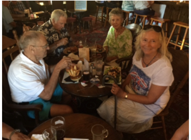
An hour later or so our meals were served! (Fun anyway!)

back to Winn-Dixie, so they got there at 6 after everyone had been served their drinks, ordered their meals and were happily conversing. (See the Hunsworths, bottom left.) Emerys and Quackenbushes shared a table and ordered their meals around 6:15-6:30--