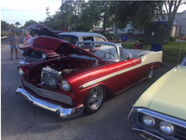
Ewings' car always shines.