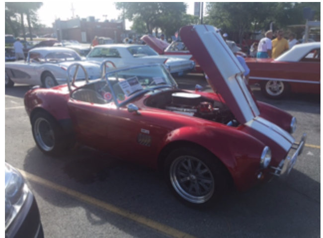
Nothing like a Cobra to steal the show.