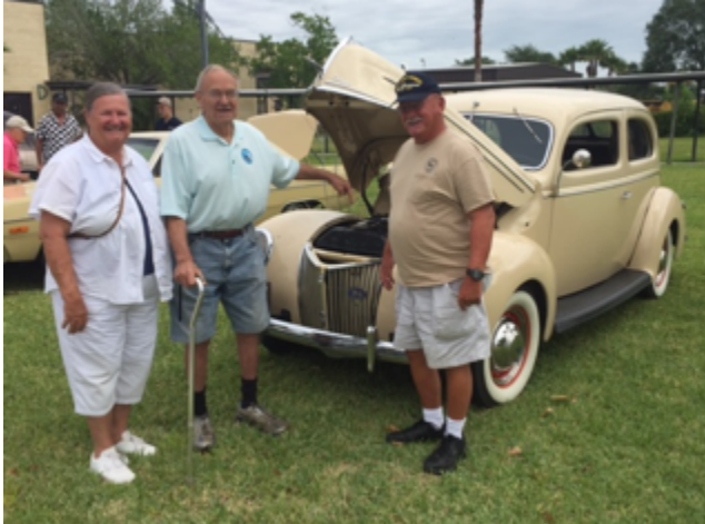
Hunsworths' faithful fabulous Ford