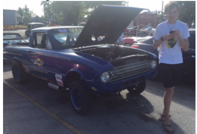
Not allowed to talk about grandchildren, but you can bring them.