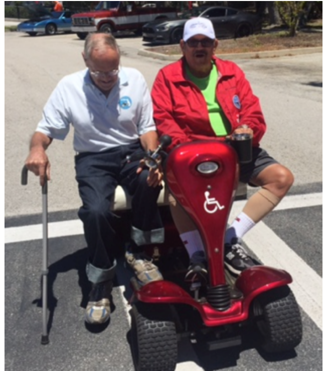
Wheels are always better than feet at a place like this!