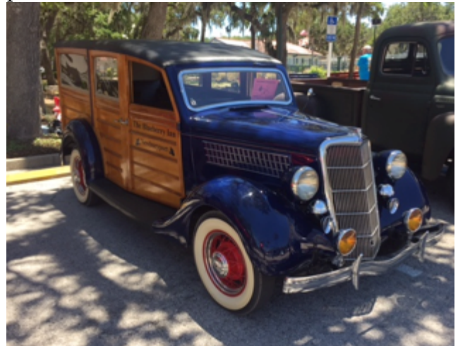
Is there anything more handsome?