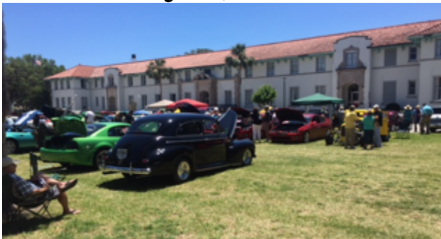
It was a beautiful, beautiful day for showing cars at the Florida School for the Deaf and Blind. It looked like a fantastic garden full of colorful flowers and the crowd enjoyed the many cars that were displayed. Here are a few: