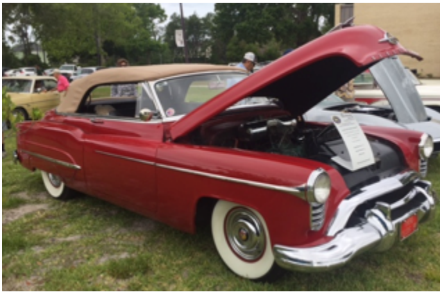
Always beautiful, Arpaia's Oldsmobile