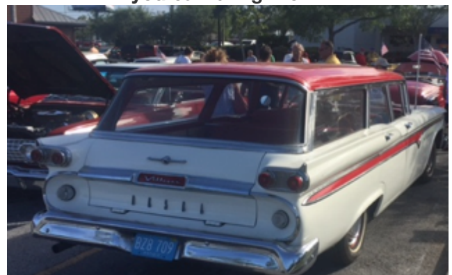
Bob Q's Edsel is happy to be back on the road. Nice T-Bird below