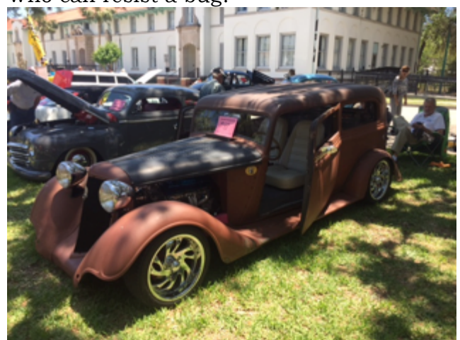
Doesn't get any better than this!