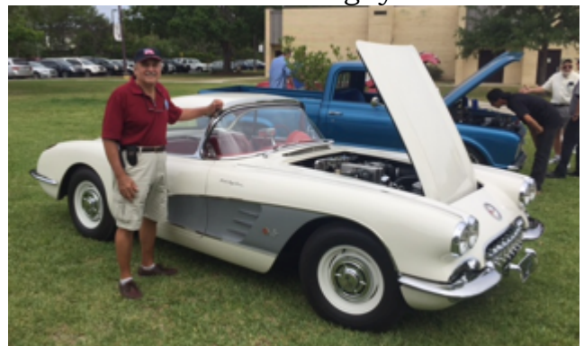
Nice from any angle.