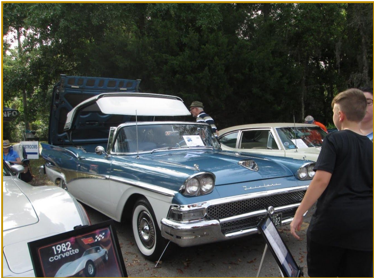
1958 Ford Fairlane Retractable Convertible

Ancient City Auto Club & Antique Automobile Club of America