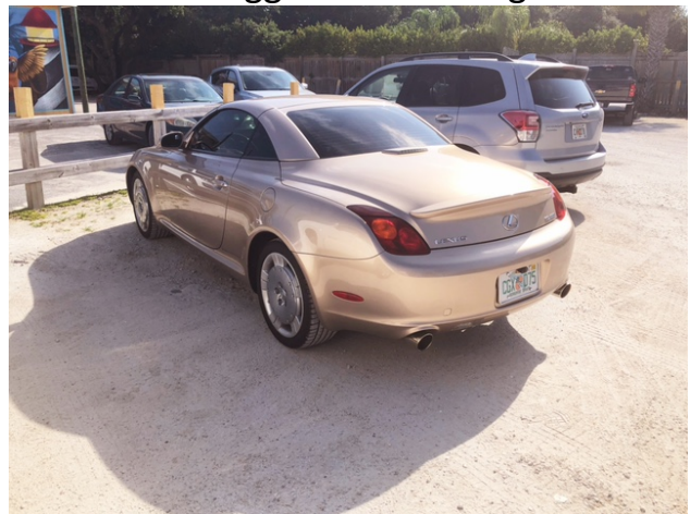
Joe Greeves – '04 Lexus SC430