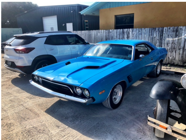
Skip Ferguson – '73 Dodge Challenger