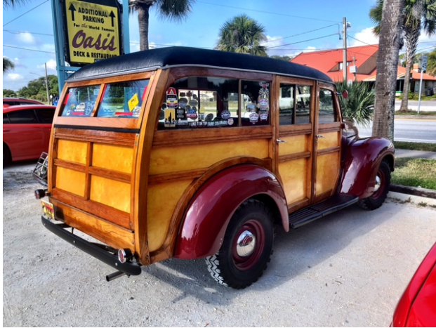
Greg Eilers – '41 IHC