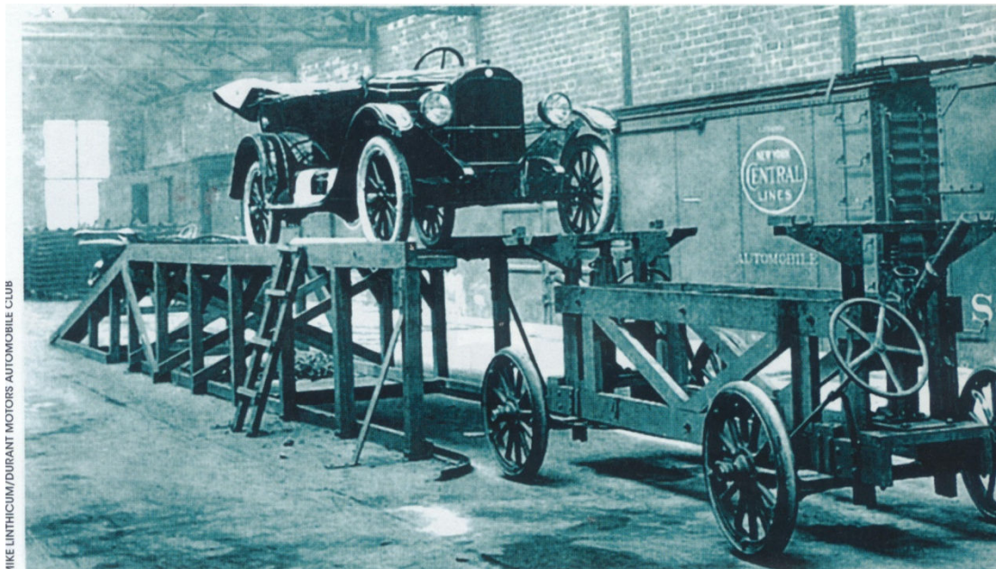
From Hemmings Classic Car magazine. 1920'S ERA FREIGHT CAR LOADER

MUST BE SEEN TO APPRECIATE: sounds like you are arranging a blind date.