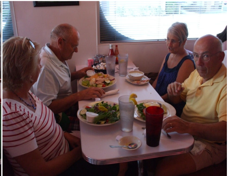
The photos we all enjoy...Great Food at Georgie's Diner

It's great to see all of our new members participating in our activities