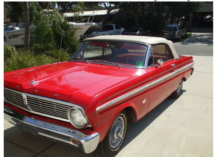
We got to polish and drive our newest toy! And Tuni looks good in it!