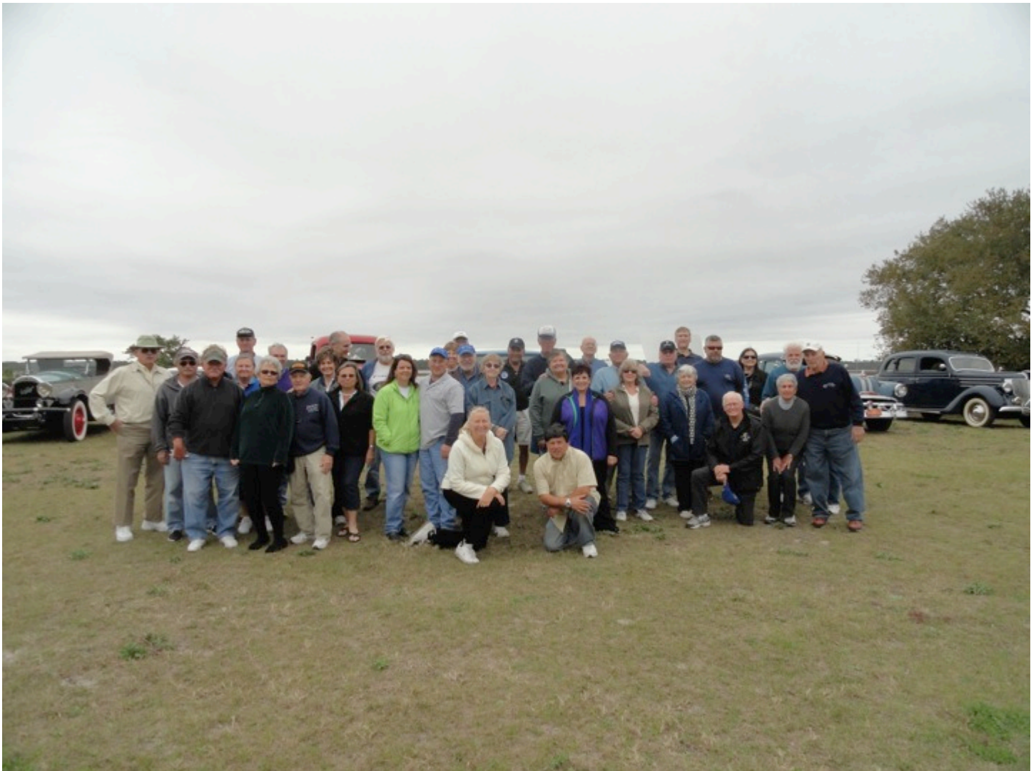
Forty of us gathered for the "Frost Bite Picnic at Butler Park, West, February 22, 2014