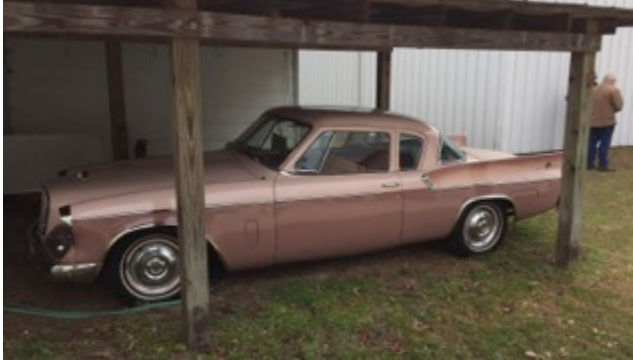
One of every color. So many Studebakers!