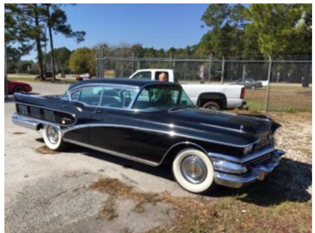
And this Buick