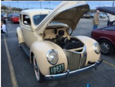
Doug Hunsworth was showing off two beauties—One older, one brand new—both Fords.