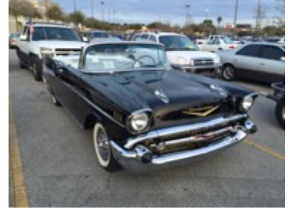
Sidney Hobb's '57 Chevy