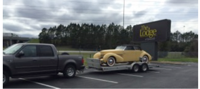
Rolling art not rolling.