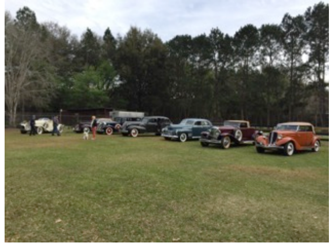
These were the cars that were touring with us.