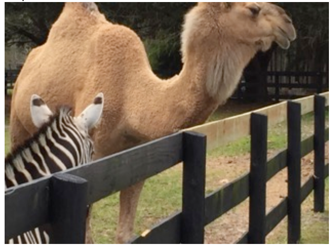
I couldn't get a good photo of the zebra.