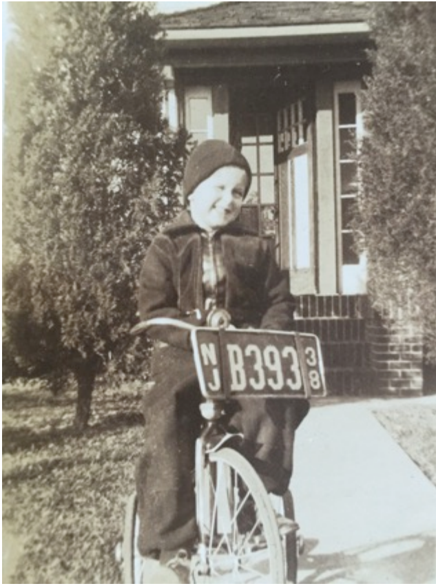
(Illustration of early on set carmania, an incurable disease)