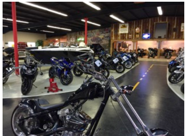
Inside lots of motorcycles sparkling on display.