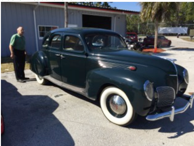
Outside we found this Lincoln