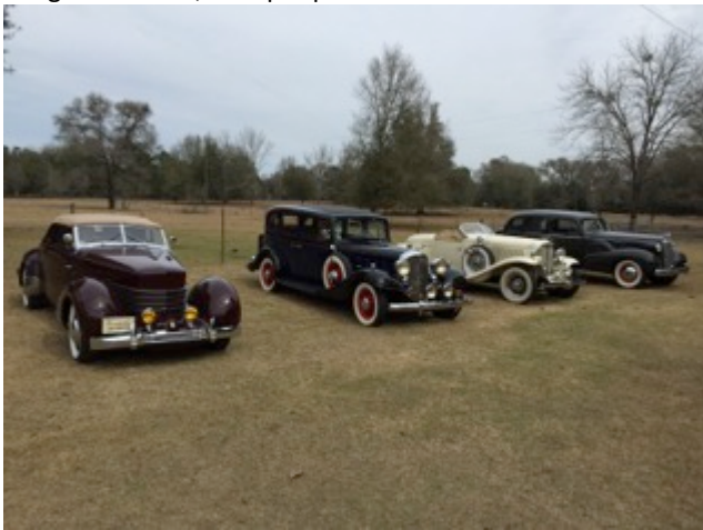
It was cold and rainy but the cars kept going well. No mishaps.