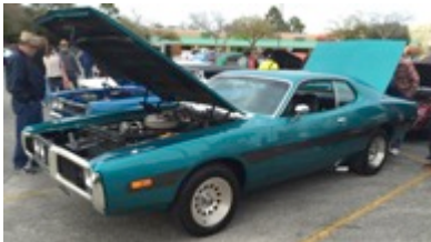
'73 Charger—Sam Ferris—First showing after 2-year restoration.