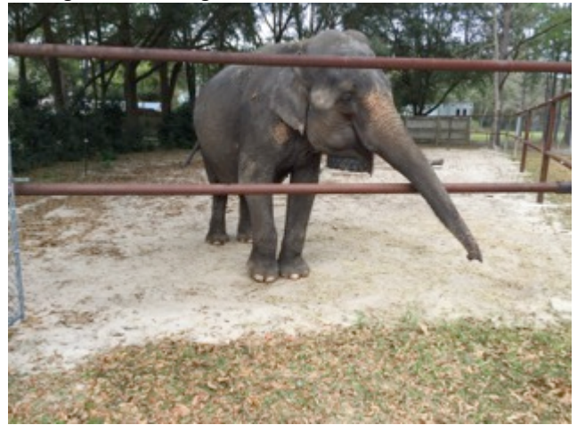
They had freckles. Curator said they might be extinct in the near future. (5-10 years) They all had such personalities!