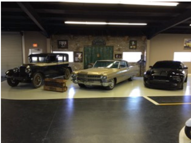
Stopped in at Visual FX on 207 just north of the railroad tracks. Beautiful showroom--