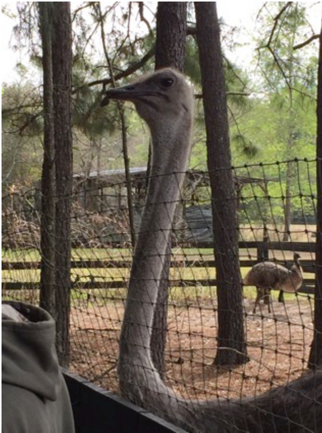
You know she has an opinion.