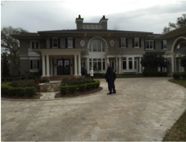
Gorgeous home; nice people