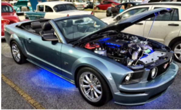
It lights up the night..