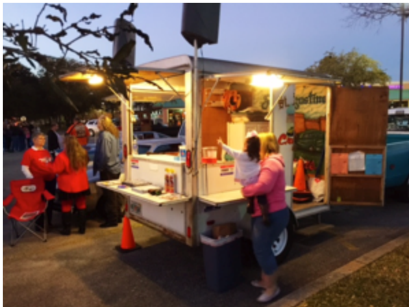
Here's where all the fun is!