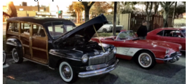
Beautiful wood; class Corvette! Notice the luminosity of the photography provided by Joe Greeves.. The whole area seems beatific in the hands of a skilled photographer. More to follow—