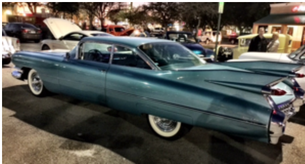
Long, low and lovely- none better.