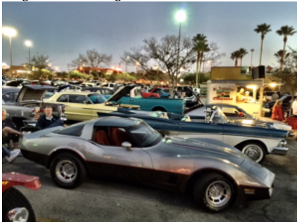
Sassy, sleek and silver.