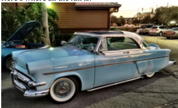
Sublime. Jaw dropping!