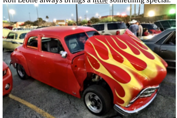
Flames light up the night.