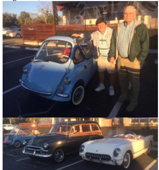
Hoptzinger’s February 25, 2016