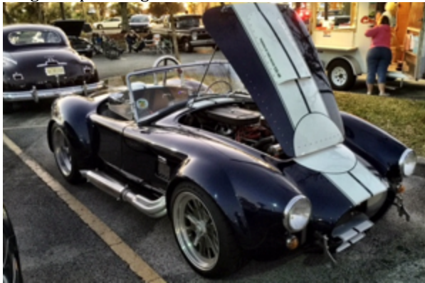
Black to black back to back.