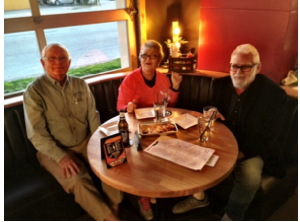
Lights at the round tables above and below.