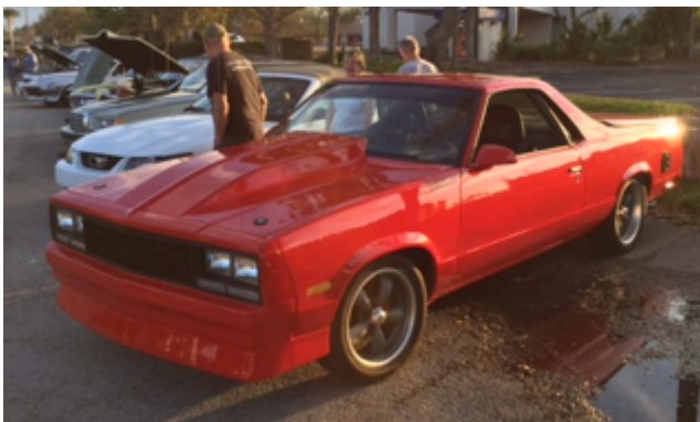
Nothin' wrong with that! Thanks to the St. Augustine Cruisers for this nice monthly event