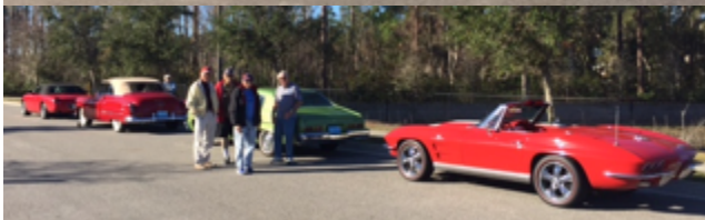
Red cars (1 green) were segregated in an efficient-for-leaving line.