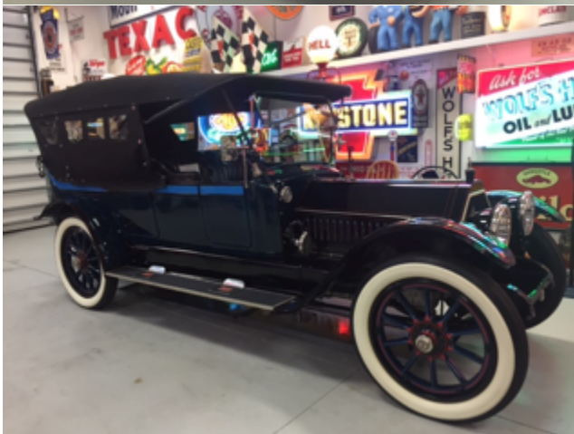
The cars range from this early Willys—