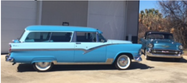
These cars greeted us at the entrance to the Koch's Garage Auto-Stalgia.