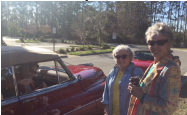
This trip was fun for the ladies, too.