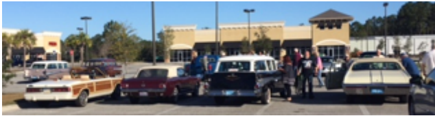
Notice the blue sky at the morning meeting place!