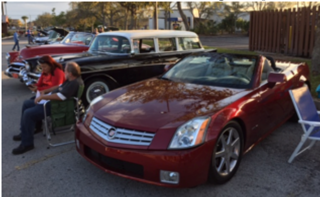
The Olde and the New—both nice!