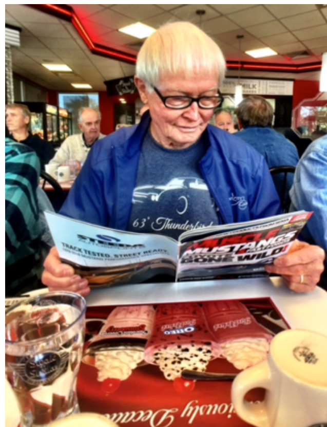
Coffee, Cars, &