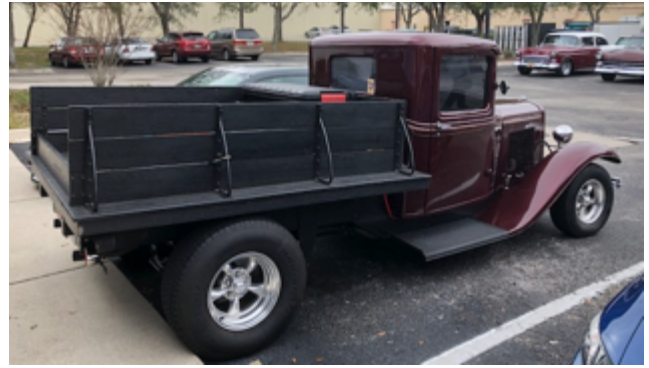
Interesting and beautiful cars attended.