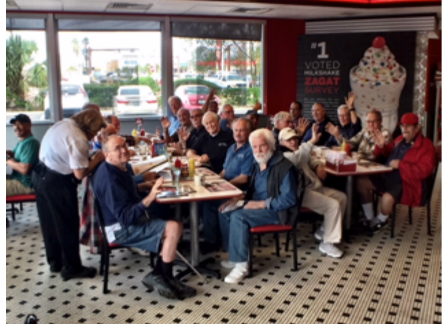
You can see that many wonderful people and cars come to this monthly breakfast. See “Blue Ticket News” for Dewey’s report. AND more cars from this event.