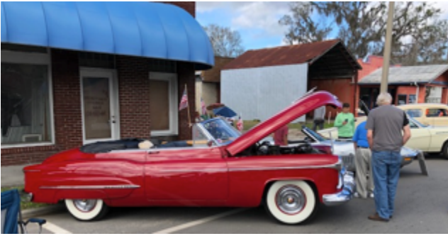
Arpaia's beautiful Oldsmobile.