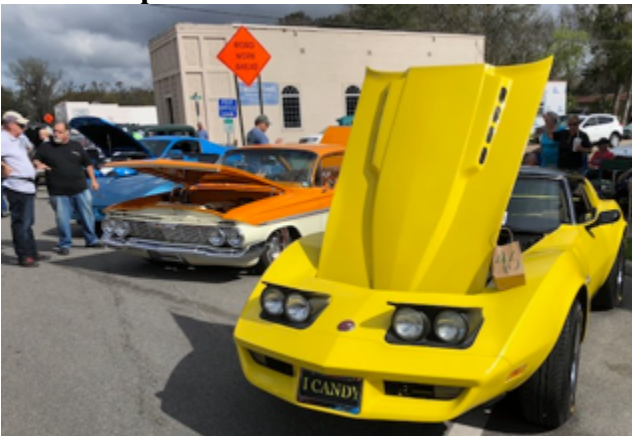
I Candy indeed.