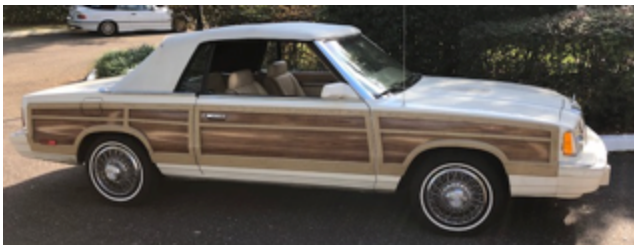
Q's Chrysler—first time out in a while.