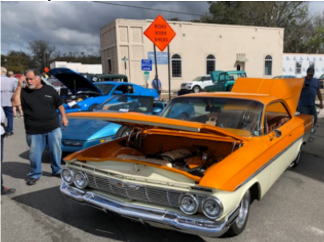
Roger Ewing's car looked good enough to eat!