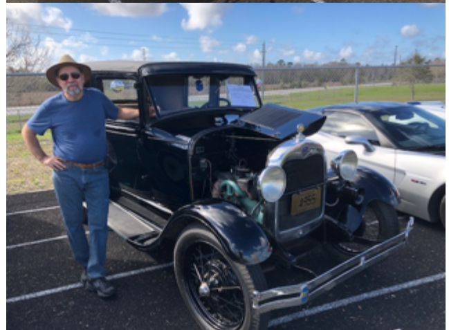
Any many, many more. A really, really, good show!