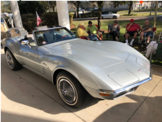
Shining silver—Battistini Corvette.