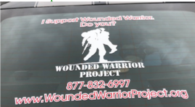
Close-up of Bob's window message.