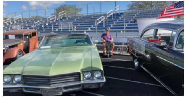
Green is good, too.