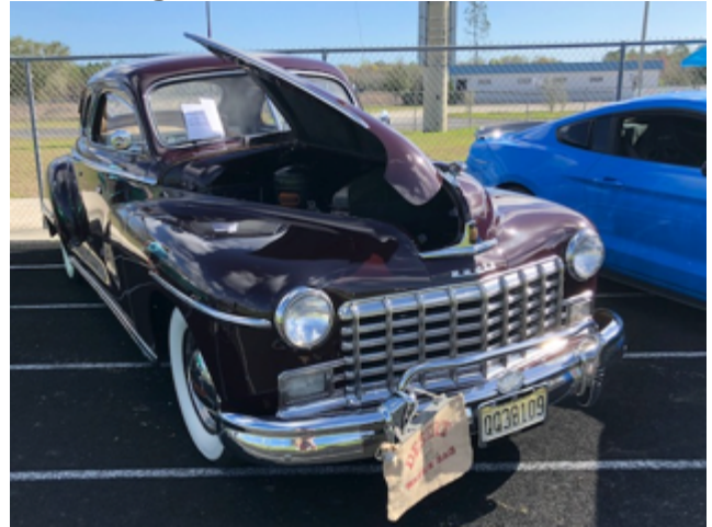
so, too maroon.