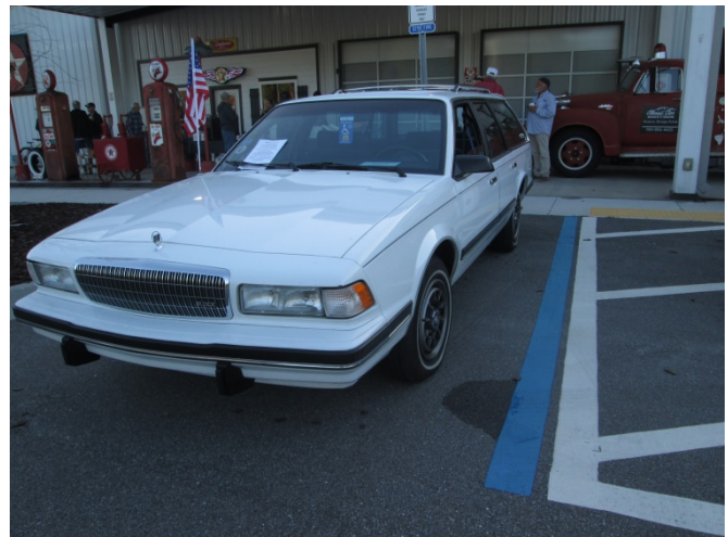
Dewey Porter – 93 Buick Century