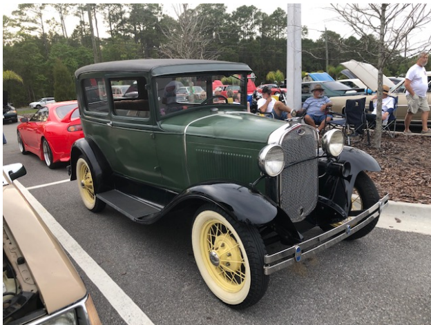
Jim Athas Ford Model A