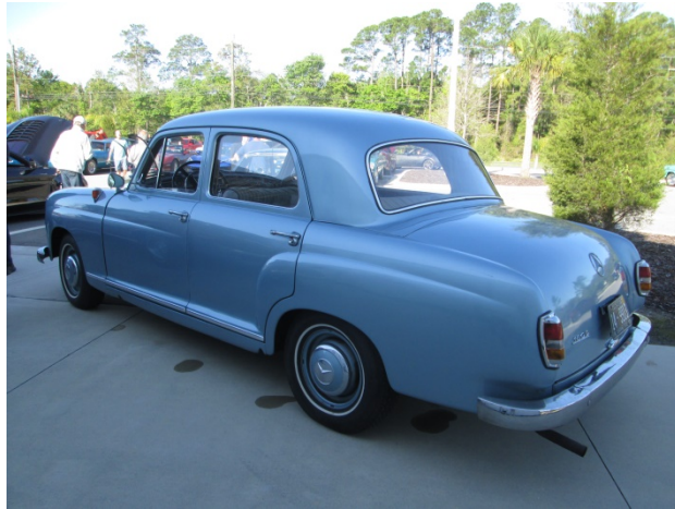
Paul Thompson - 1961 Mercedes 190