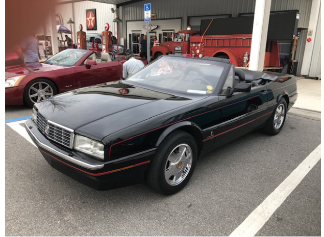
Bob Kessler Cadillac