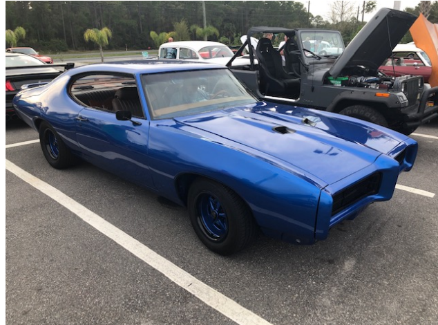
Skip Ferguson Pontiac