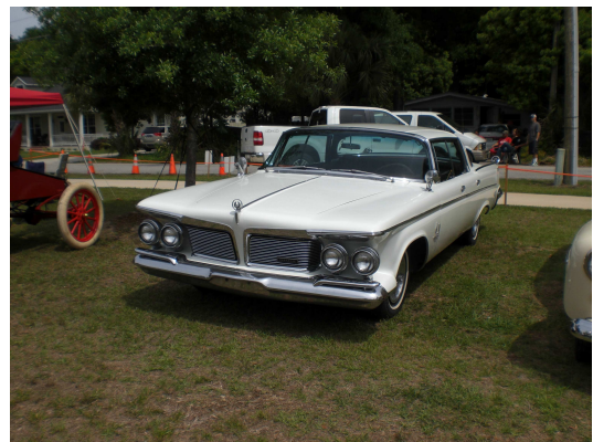
NED KRAFTS CHRYSLER IMPERIAL THE BIGGEST