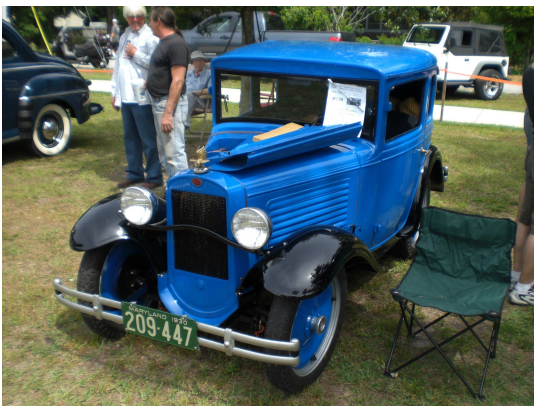
AUSTIN BANTAM, THE SMALLEST