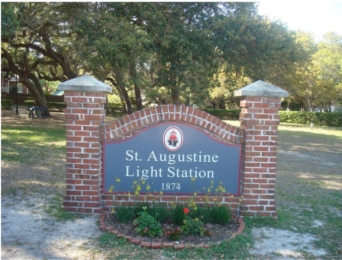
Established in 1874