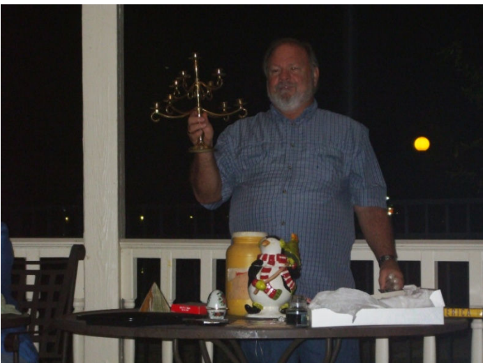
Our wonderfully entertaining auctioneer and auction