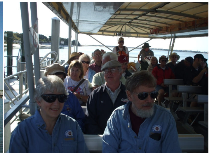
our ferry ride across the intracoastal waterway