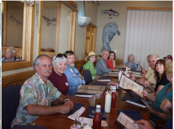
After lunch, we were back into our cars and off to the maritime museum in Welaka, Florida