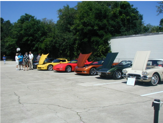
Nice Show of Corvettes