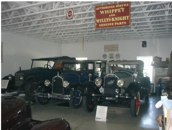
The "neat" part of the Weiss garage