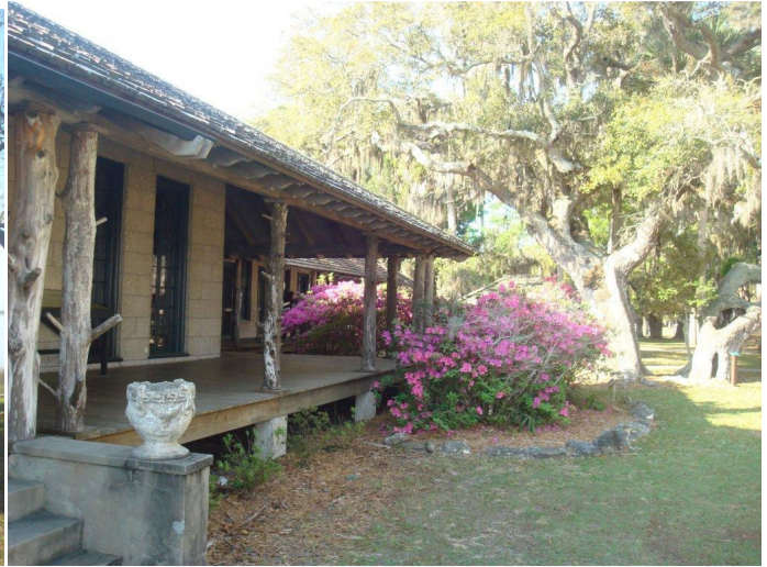
The bath house and a side view of the cottage

After a treat of cookies and water, we were back on the road through farms of the area and of course...lunch!!! We waited out on the deck while our tables were set up at Corky Bell's restaurant on the St. Johns River.