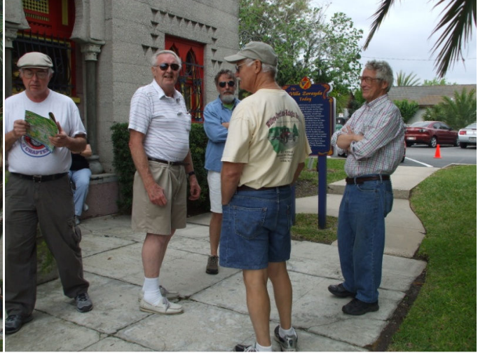
Our guests wait outside for our tour