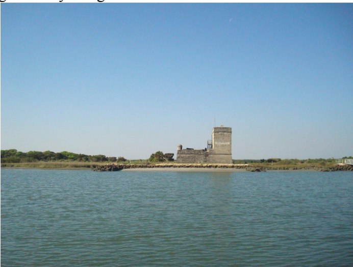
The Fort from Anastasia Island

Friday morning, an early rise and shine day...things to do, places to go!!!! Our drive had us heading out early, down scenic highway A1A to a tour of Fort Matanzas built in 1740. A short boat ride to the fort we were greeted by our guide from the Park Service.