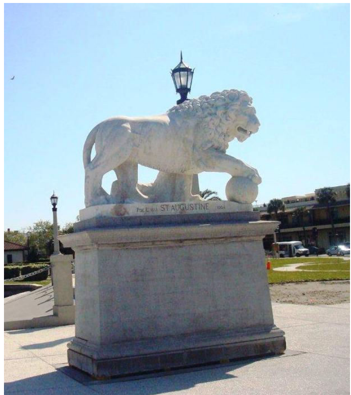
The marble Lions near the bridge of Lions back in place

When we finished the tour of the castle, we were free to wander around downtown in the historic district and enjoy lunch at many of the city's restaurants, we decided to visit the Lightner Museum, which was formally the Alcazar Hotel, which was owned by Henry Flagler in the 1920's, but now serves as a museum and the City of St. Augustine offices and enjoyed our lunch in the area that used to be the indoor swimming pool.