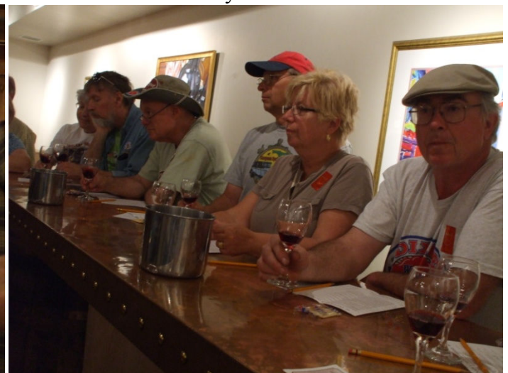
At the winery we learned to swirl, look, sniff and sip!!!!