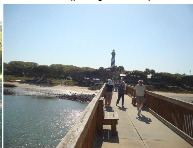
The pier and lighthouse in the background