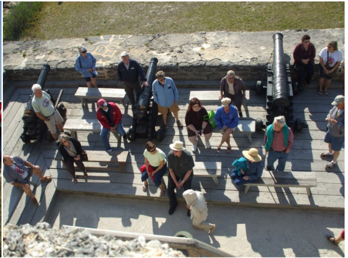
a view below from the roof of the Fort