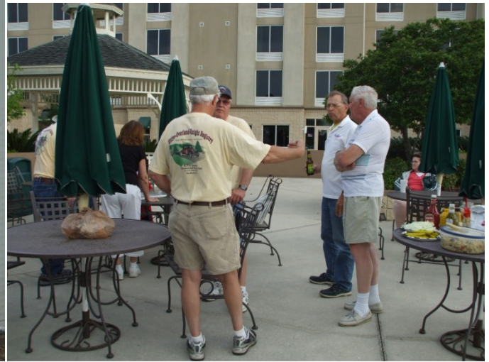
Ahhhhhhh finally time to relax by the pool and lake