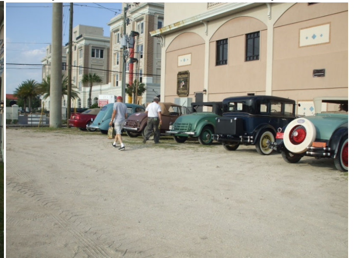
Can you believe we did all of these tours in one day????

Friday morning, an early rise and shine day...things to do, places to go!!!! Our drive had us heading out early, down scenic highway A1A to a tour of Fort Matanzas built in 1740. A short boat ride to the fort we were greeted by our guide from the Park Service.