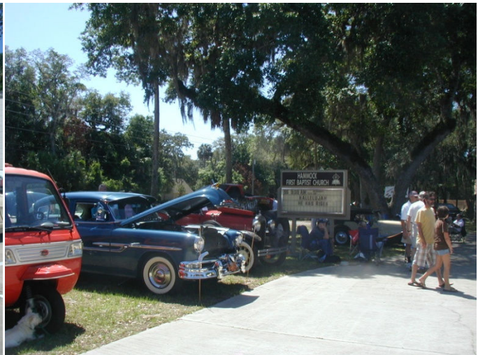
Some of our ACAC Cars