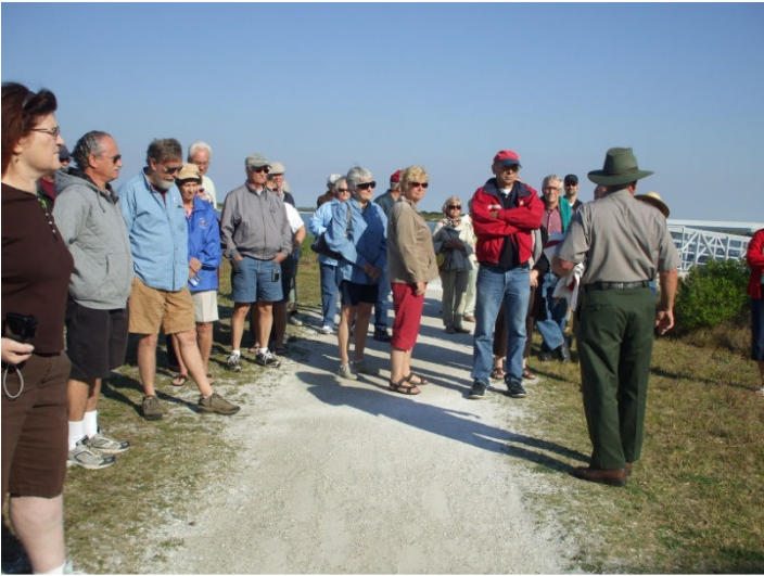
Our history guide