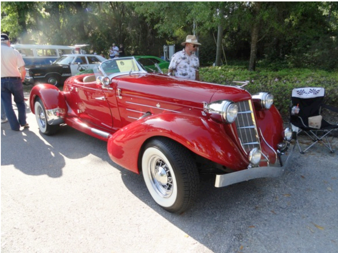
This car was my favorite car at the show—the Pastor's choice as it turns out!