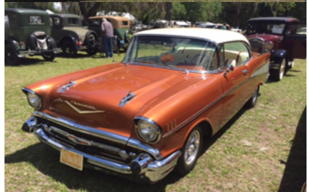
Orange you glad?