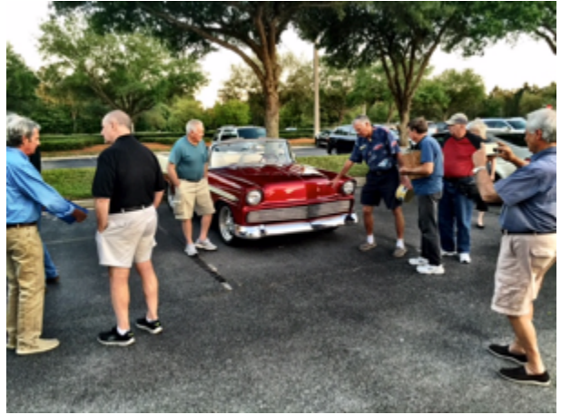
Every one was in love.