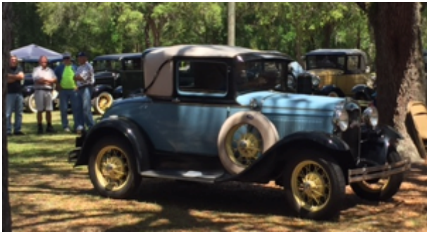
Pretty in blue.