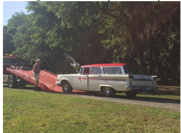
The Edsel had to be transported back to Quackenbush's garage. The brakes had not worked for most of the drive over earlier.

Don't Forget the Meeting—May 5 Eat at 6 Meet at 7 Caddy Shack