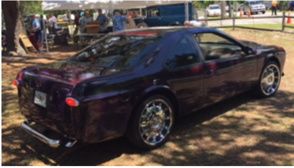
This one was iridescent.