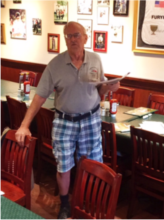
A few words from the expert.