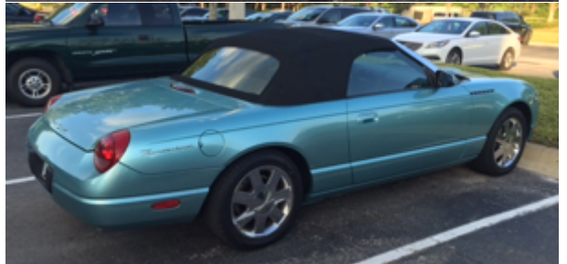
Cars pictured spotted at the meeting!