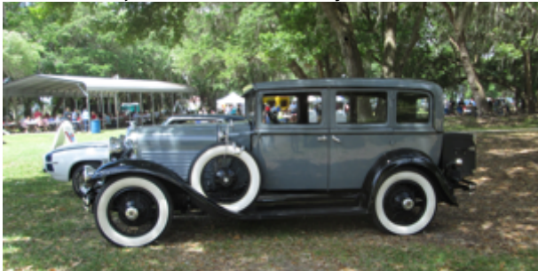
it wasn't a Marmon and the—not a Willys either.