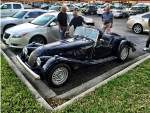
Notice the dropped jaws.