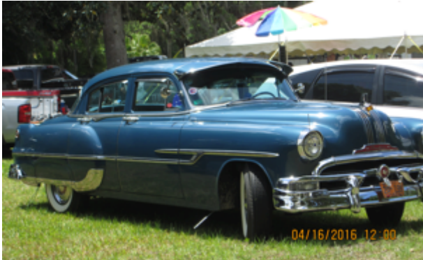
Quite a few people posed in front of these pretty cars while many enjoyed just looking because they used to have one just like that one, only.....