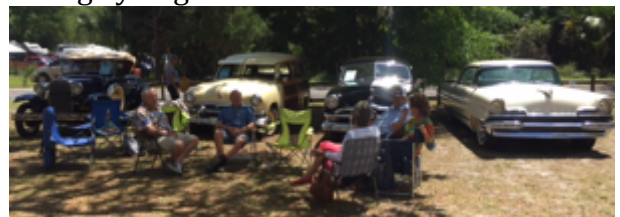
We had our own little camps in various places. I fell asleep in the quiet conversations—they had fried cheese curds, pop corn and hamburgers/hot dogs.