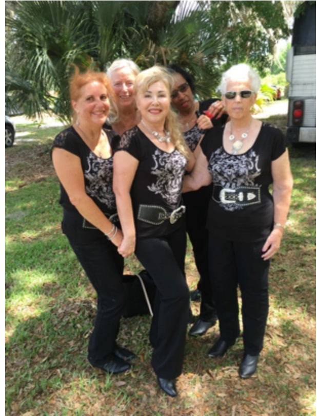
The St. Augustine Line Dancers performed Gospel.