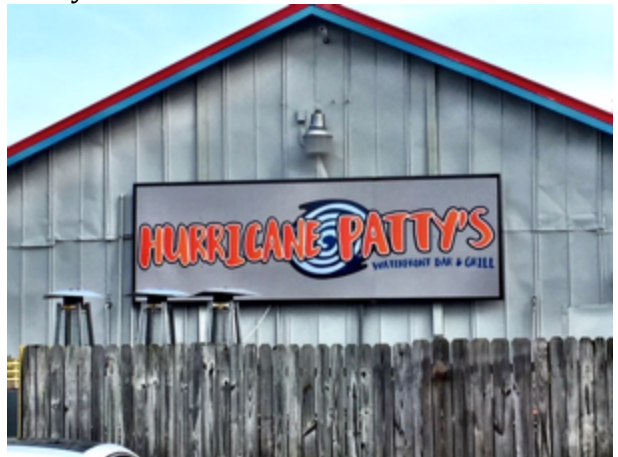
Eating Out with ACAC April 28