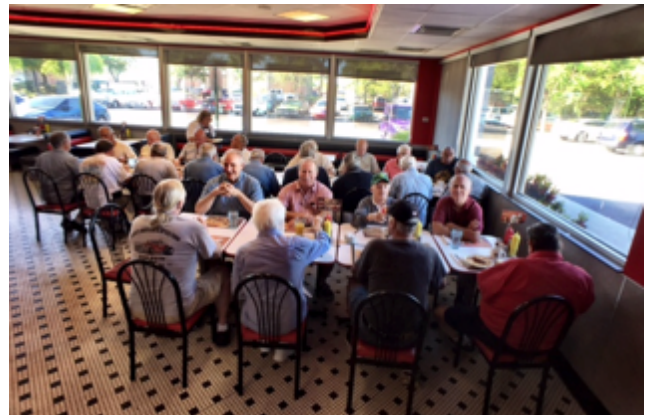
Any way you look at it—look through the windows and you can see the cars lined up.