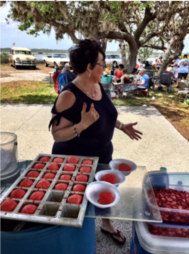
How many pounds of strawberries?