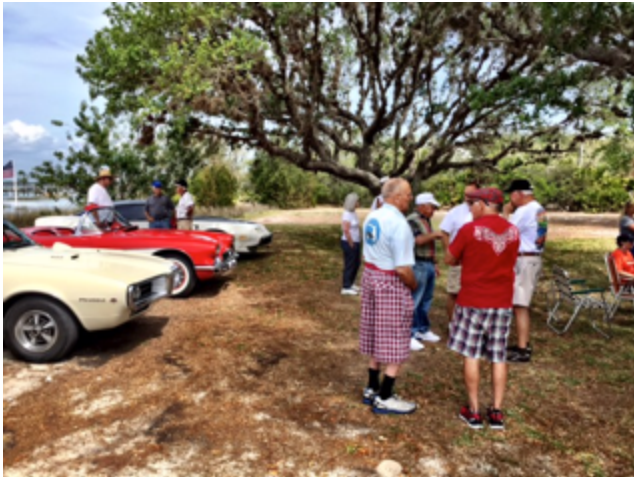
One of these guys is a Scot, the other just likes plaid pants!