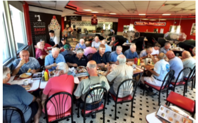
This event keeps getting better and better!