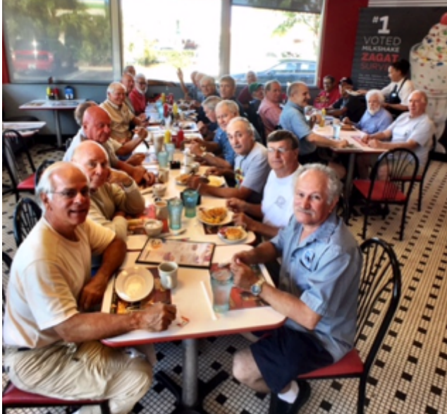
Don't miss May's gathering—5-12, 9 AM