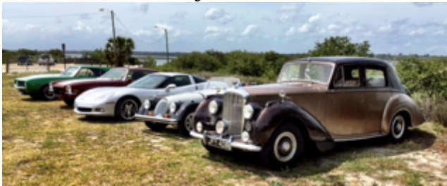
Nice line up!