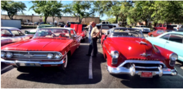
Red cars always make a good showing!