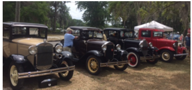
One of the trophies was for best Model A.