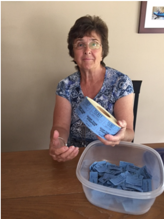
New Blue Ticket Lady

Bill Soman conducted 3 car games: 1. Potato race, 2. Over the cliff and 3 Back into the garage. First and Second place winners received $25 gift certificates good at 16 of St. Augustine's finest restaurants.