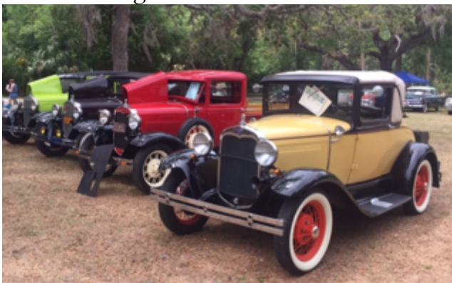
A nice display.