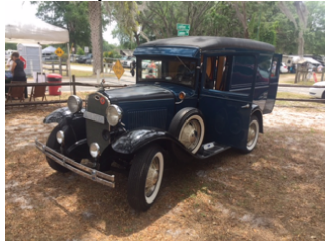
I think this was a hearse.