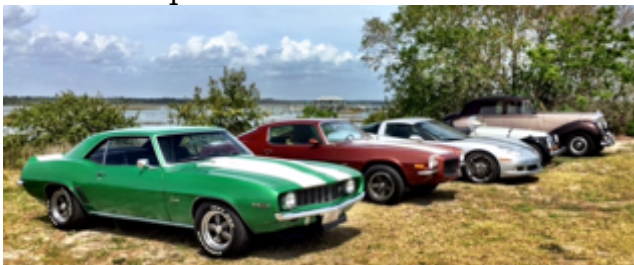
Either way you look at it.!