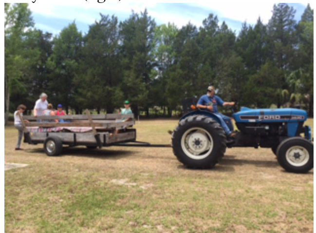
This pictures Rita hayriding home from the Underhill Home (1879).