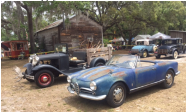
There was no fee to enter your car.