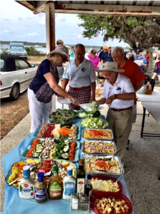
These were just the appetizers!