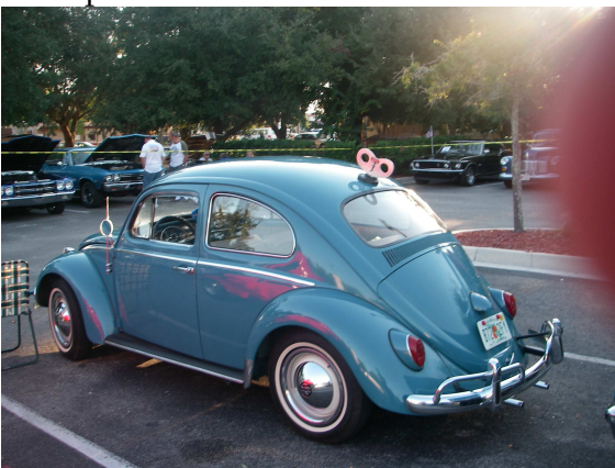
No other bugs allowed.