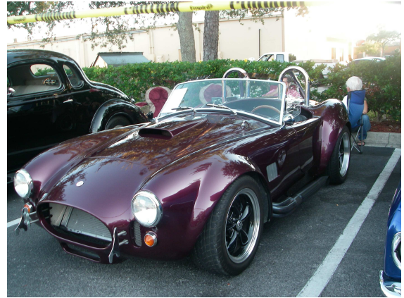
Here is another beauty that was displayed. The next cruise is November 13 th —5-8 pm.