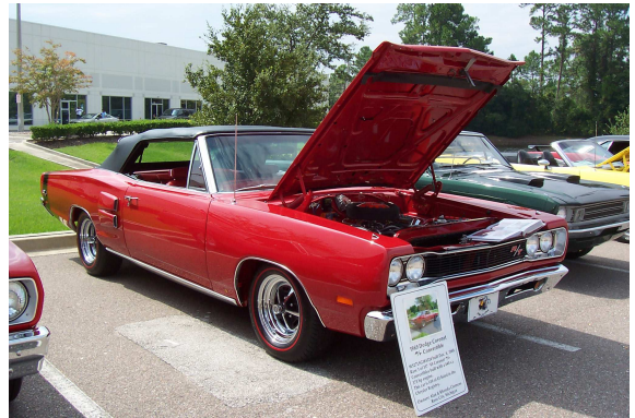
AWARDED BEST IN SHOW