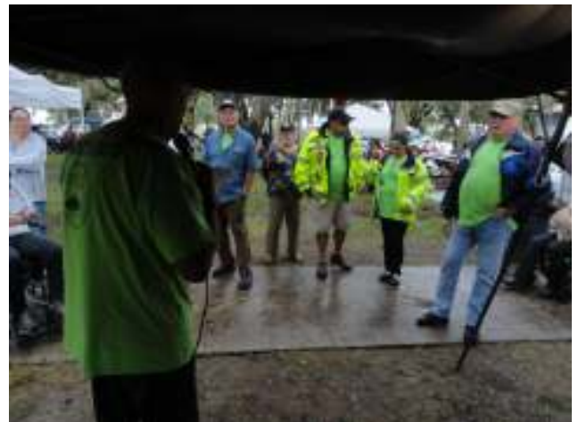
And this is the view from inside the announcer's "lean-to" with club members vying for prizes at the 'trivia' game. -As people were leaving, I got to take a few more photos here—