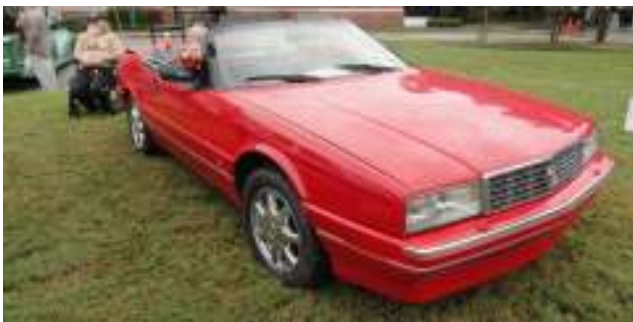
1990 Cadillac Allante—Owned by a veteran, it was a prize winner, I believe.