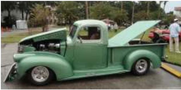
1946 Chevy Pickup owned by Dan Briagle, JAX.