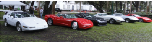
So many beautiful Corvettes!