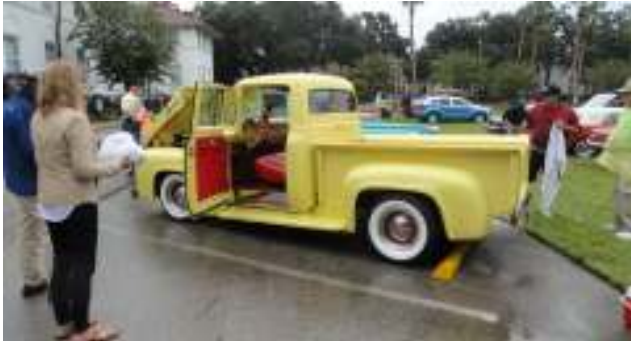
A pretty collection of special trucks gathered.