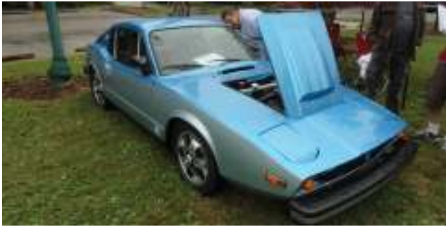
1973 Saab Coupe - Jacksonville