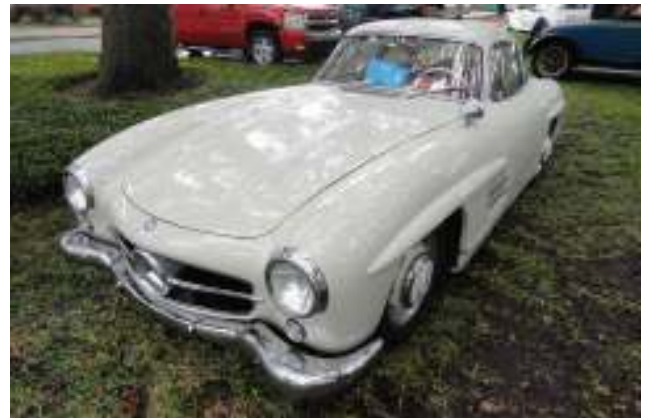
Here's the Gullwing again, all by itself.