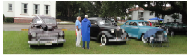
Other Plymouths joined the first.