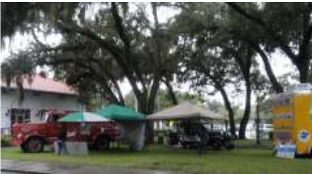
The barbeque was wonderful --pretty fire truck! – hot dogs superb, even the ice cream was so wonderful that we ate it even shivering.