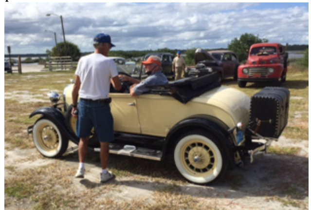
You can see just where the blue and the gray were meeting in the sky.