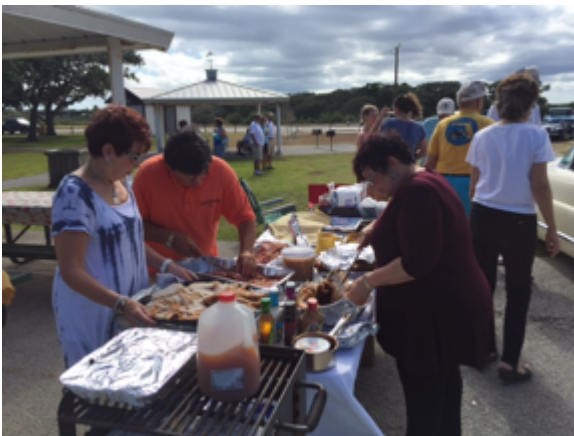
These worked while others played games.