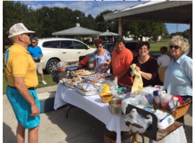
When they were all done, it was a beautiful presentation!