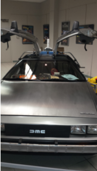
There was even a Back to the Future car. We spent a while there

viewing all three floors even walking into one of the buses. The bus actually had a smoking section in the back; I sure don't understand how the entire bus wasn't affected by the smokers as it is surely not separated from the rest of the bus. It was also next to the kitchen and of course the toilet.