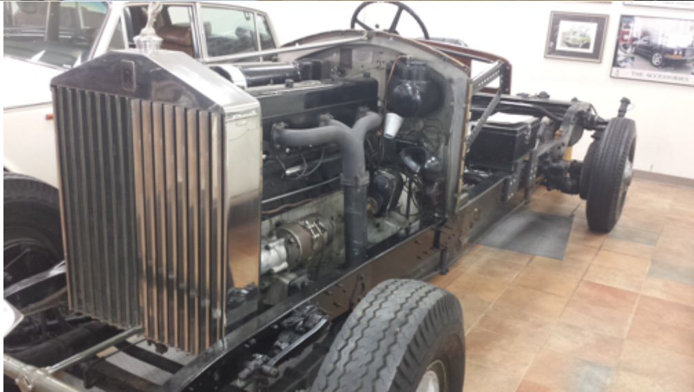
At the Rolls-Royce Club