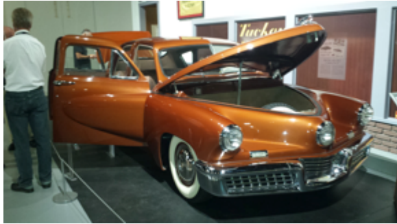
Here is the Tucker