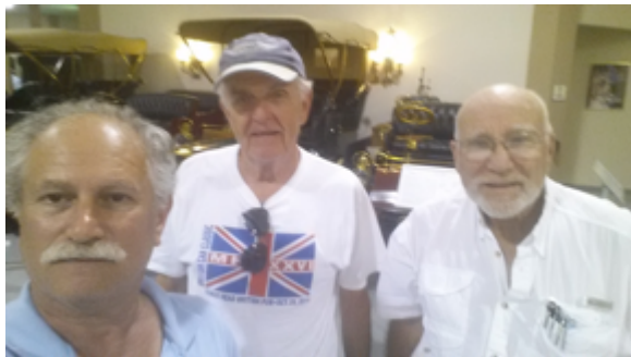
Never Tuckered Out!