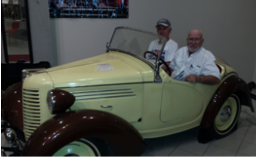
(HA, HA, HaA). Brand of Car?