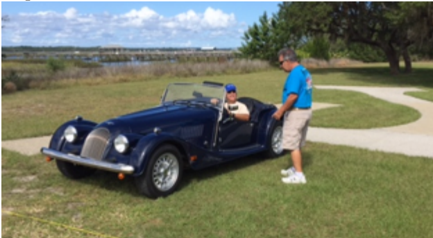
Starr's car did not.