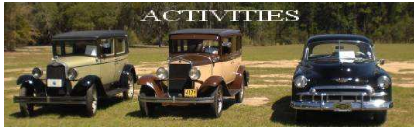
Oct 13 ACAC DYOC Day. Drive your car and send a photo to newsletter editor for Olde News

Oct 16 Six Flags Annual Car Show by Amelia Cruisers Fernandina Beach a flyer and entry form can be viewed and downloaded at this link <a href="http://www.ameliacruizers.org/carshow/2010/">http://www.ameliacruizers.org/carshow/2010/</a>