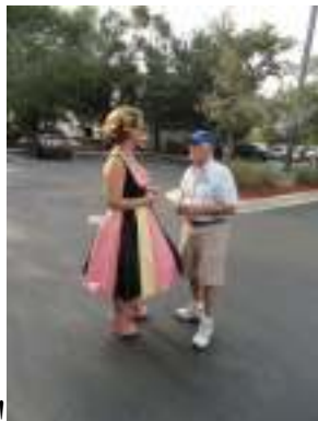
Carley were there!