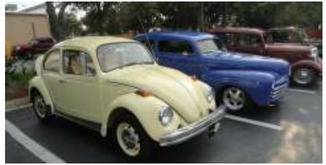
Colorful line up including Becky's '74 VW

I don't know whose Studebaker this is, unusual, though.