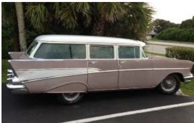
Max's mighty '57.