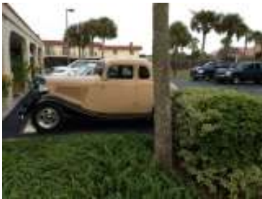
Youngs dress up Wildflower Café.