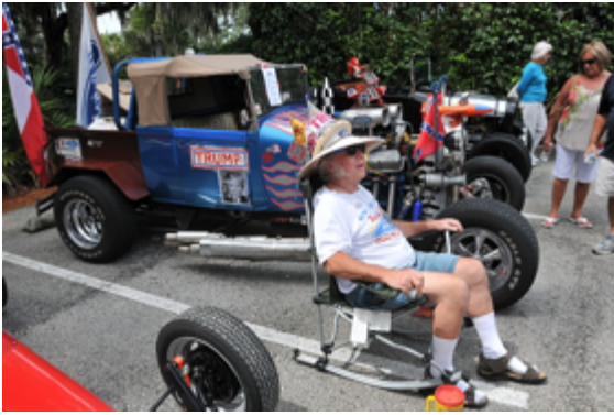
Everybody's gotta' love something!