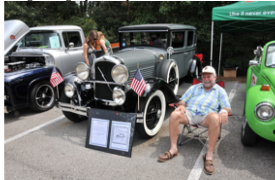
Obviously ecstatic Marmonite.