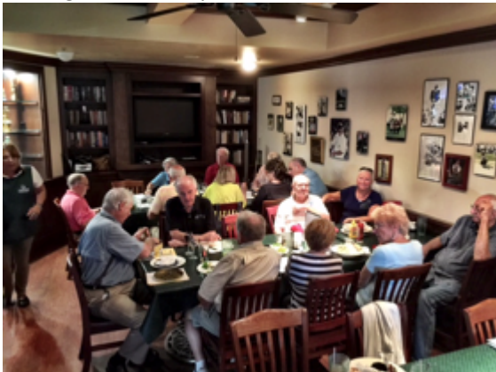
We all have fun at the monthly meetings at Caddy Shack.