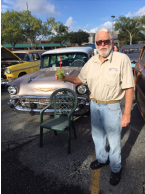
Max said it didn't taste as good as it looked.

St. Augustine Cruisers have perfect weather for their September cruise-in!