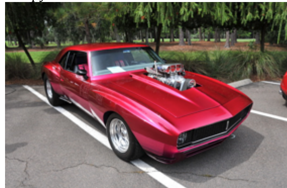
So much engine it wouldn't fit.