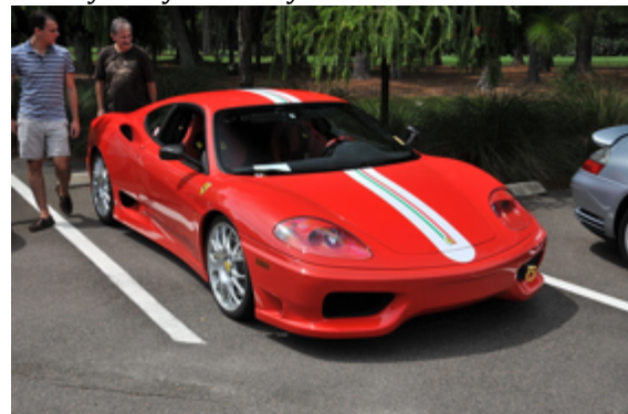
Sleepy look—bet it's not.