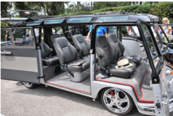
I guess we would all fit!