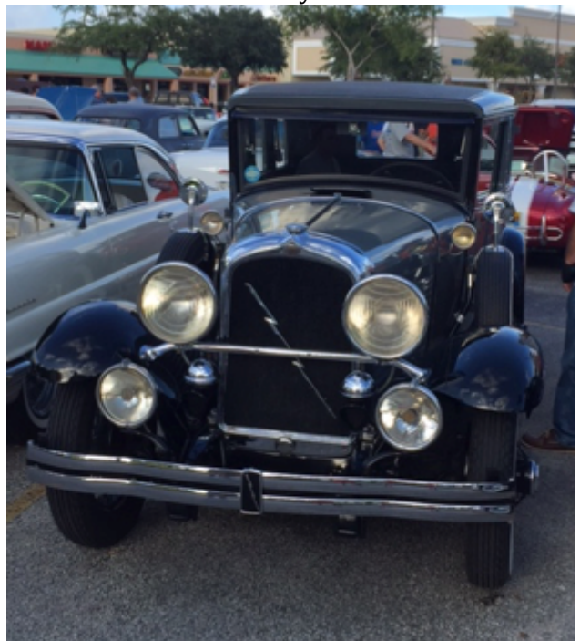
Recognize this car? It may be the day it came home—still in the family!