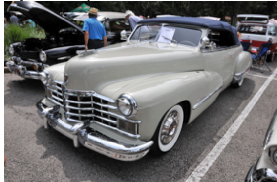
Gorgeous grey Caddy.