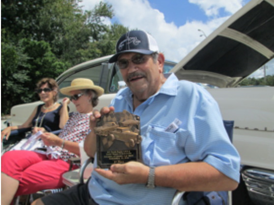
Arpaia's Lincoln was very popular as many 50/50 ticket buyers used it when they bought car length tickets. It also won second place in the 50's decade class – Dewey Porter