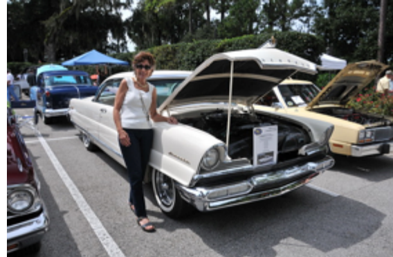
Lovely Lady—Lovely Lincoln.