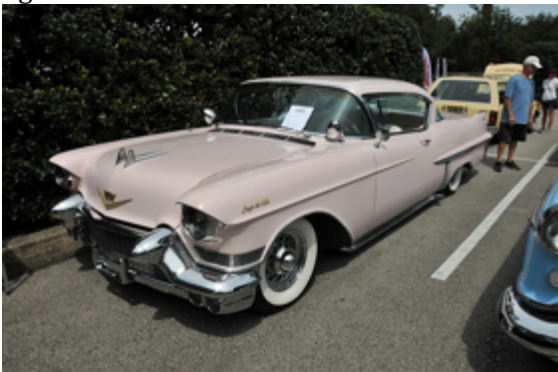
My kind of ride!