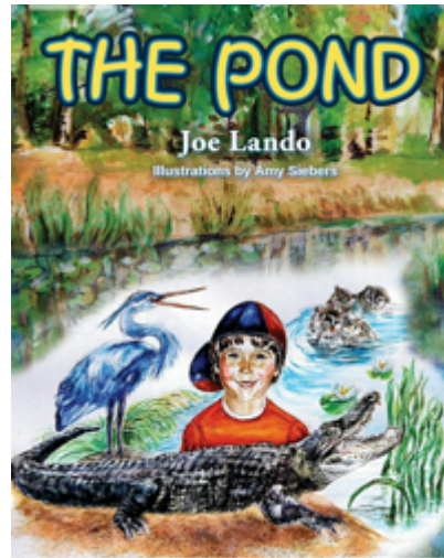
Ancient City Auto Club

time-consuming but we prevailed. The book is a fantasy tale that tells of one little boy that wants to solve a problem when he hears the wildlife in the pond talking to him! It's a wonderful story that teaches students to problem -solve with a science component added in. A great book to share with grandkids! Book can be purchased from Amazon or any on-line book store. Booksignings and in store sales is forthcoming.