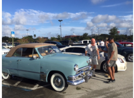
Great day for olde cars!