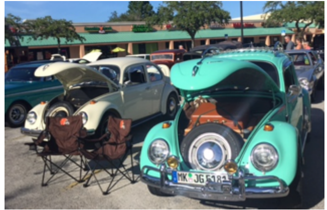
A pair of pretty bugs.