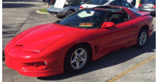
2002 Firebird was offered for sale for $6000.