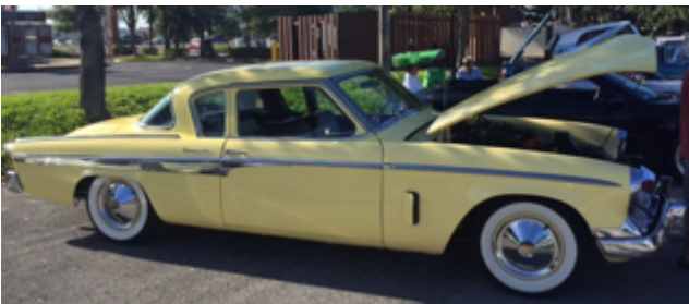
This yellow Studebaker shines bright!

Cary Weisenbaker always does a good job of keeping the laughs flowing and fun happening. It looks like he's in the dark, but looks are deceiving. Here are a few of the beautiful cars that were there.