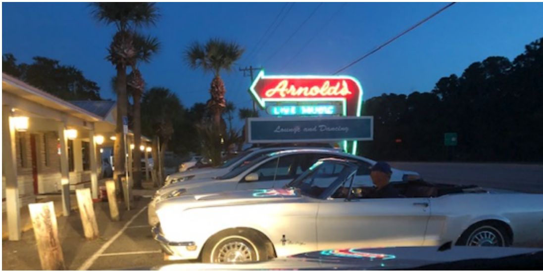
Poifect 2-Convertible Night-Eat Out 9-27-18