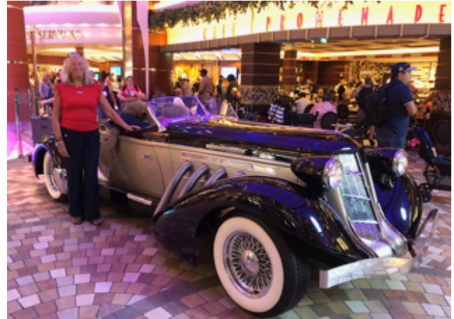
Felt right at home on the "Oasis of the Seas" with this beautiful Auburn convertible as a mascot.