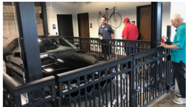
Elevator at Art 'n' Motion