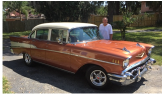
Handsome visitor (Joe Lando) stopped by with gorgeous '57 Chevrolet.