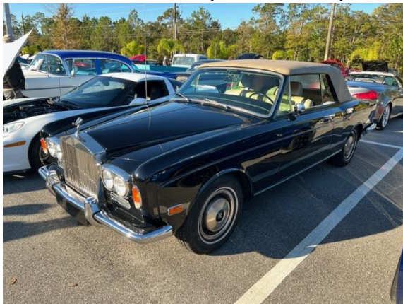
Jim Weiss - Rolls Royce