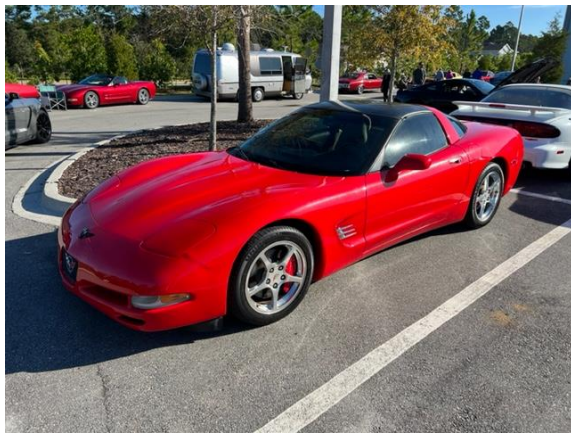
Joe Lando - Corvette