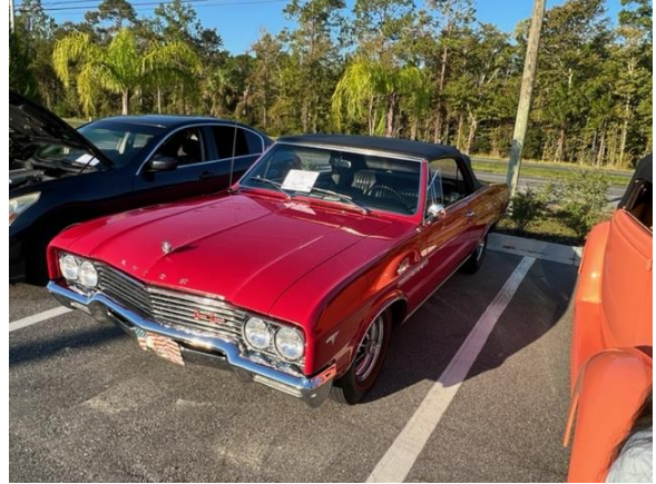
Glenn Bakst – '65 Skylark