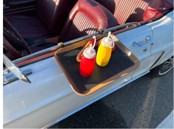
Remember the drive in trays?