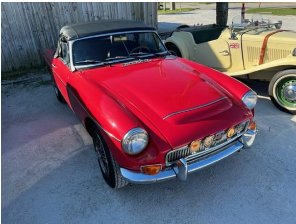
Dave Burrows – '69 MG C