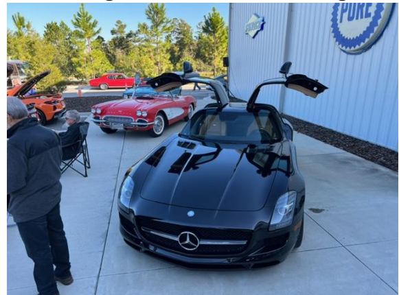
Modern Mercedes Gull Wing

The list of Up Coming Events is distributed separately every Monday.