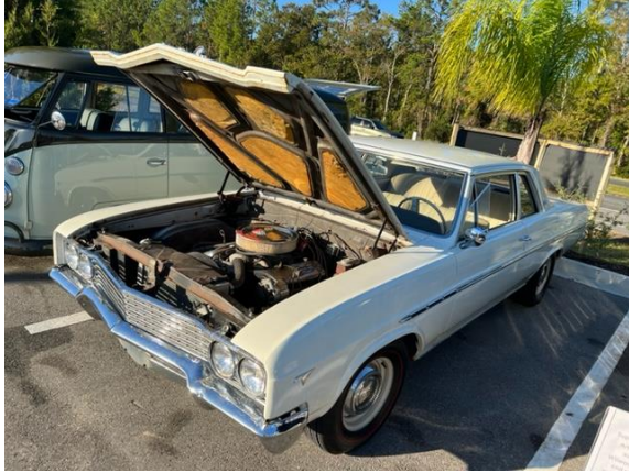
Glenn Bakst – Buick