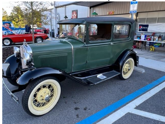
Jim Athas – '30 Model A