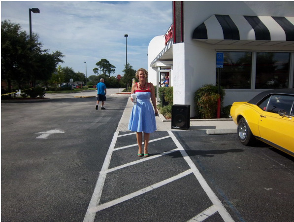
Steak 'n' Shake Cruise In August 14 th —And we ate. Pretty Lady.