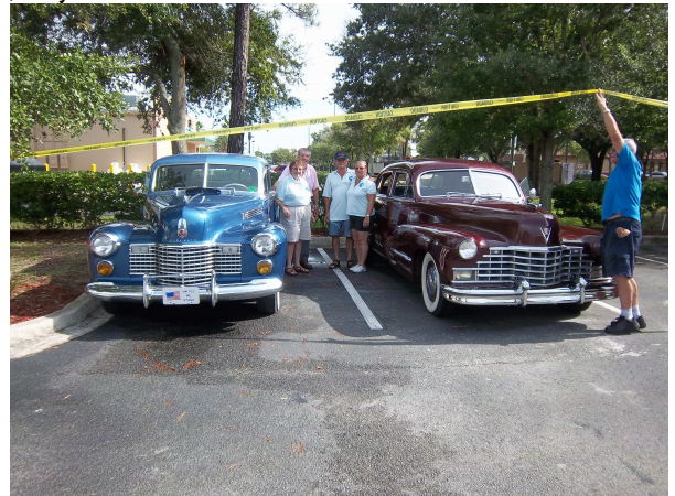
Make way for the peoples.