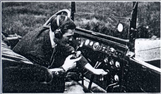
The Automobile Wireless in Use.

Wireless telegraphy and telephony have made marvellous strides in the past few years. It rather looks as though we would be free from the twittings of telephone Central within a few more years for a new portable