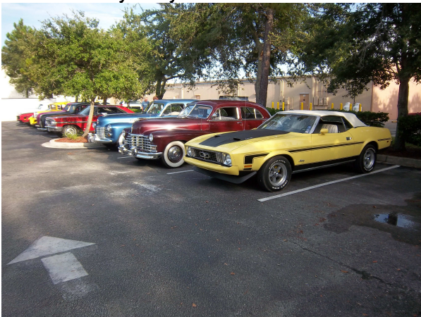
Nice line up of cars.