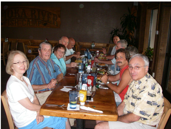
The restaurant had reserved a really nice table for us with a good view and the ambiance made the evening fun.